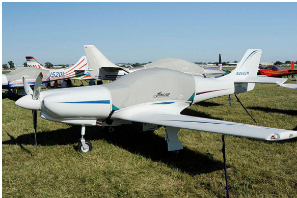
Lancair 360 MkII Canopy Cover

This cover type is made from Silver Acrylic Sunbrella canvas and is 100% lined with a soft and smooth microfiber. Bruce's Custom Covers developed this material combination especially for aircraft protection. The outer material is medium weight and treated for water resistance, UV resistance and anti-static buildup. The inner lining is a very soft and smooth microfiber to prevent scratching. The material is very reflective, and tests show that the cabin interior temperature can be reduced to near-ambient temperature on the hottest of days. It is water, ice and snow repellent, yet breathable to allow moisture to escape from between the cover and the aircraft surface.