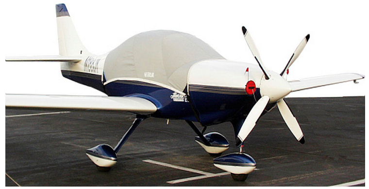
Lancair ES Canopy Cover