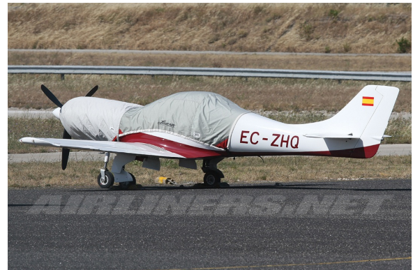
Lancair 360 Canopy Cover, Engine Cover