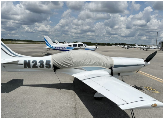
Lancair 235 Canopy Cover

Travel Covers are made with Silver Solution-Dyed Polyester fabric and only lined over the windshield to save weight. The material is lightweight and more compact for easy stowage in the aircraft. The polyester material is water resistant, but only intended for occasional use outside. We also have an ultra lightweight material available for fitted hangar dust covers. For daily outdoor use, the non-travel Sunbrella Cover is the best choice.