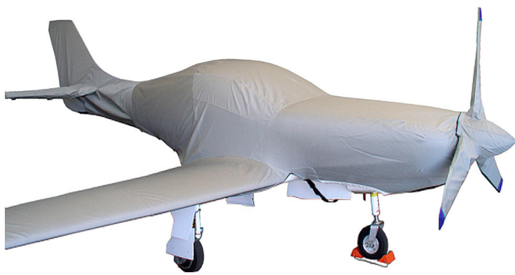
Lancair 320 Complete Fuselage/Wing Cover & Prop Cover

This cover type is made from Silver Acrylic Sunbrella canvas and is 100% lined with a soft and smooth microfiber. Bruce's Custom Covers developed this material combination especially for aircraft protection. The outer material is medium weight and treated for water resistance, UV resistance and anti-static buildup. The inner lining is a very soft and smooth microfiber to prevent scratching. The material is very reflective, and tests show that the cabin interior temperature can be reduced to near-ambient temperature on the hottest of days. It is water, ice and snow repellent, yet breathable to allow moisture to escape from between the cover and the aircraft surface.