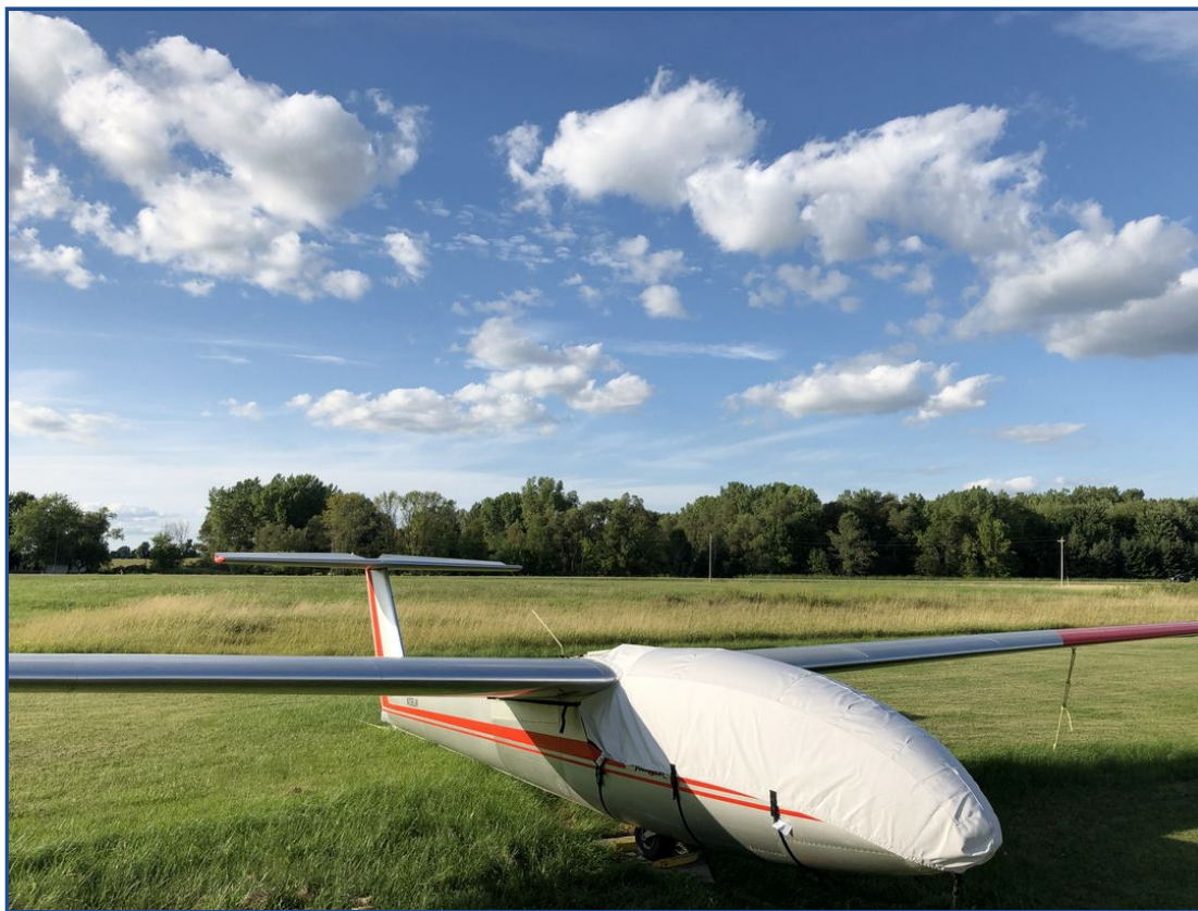
L-23 Super Blanik Canopy/Nose Cover