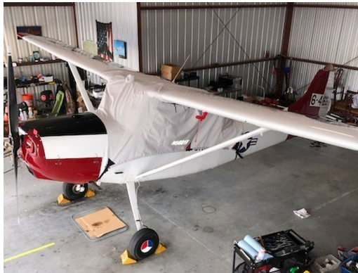
Cessna Bird Dog, L-19, O-1, 305 Canopy Cover, Over-Top Type