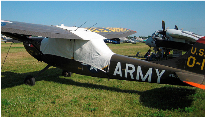
L-19 Canopy Cover