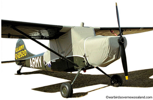
Cessna L-19 Canopy & Engine Covers

The material is very reflective, and tests show that the cabin interior temperature can be reduced to near-ambient temperature on the hottest of days. It is water, ice and snow repellent, yet breathable to allow moisture to escape from between the cover and the aircraft surface.