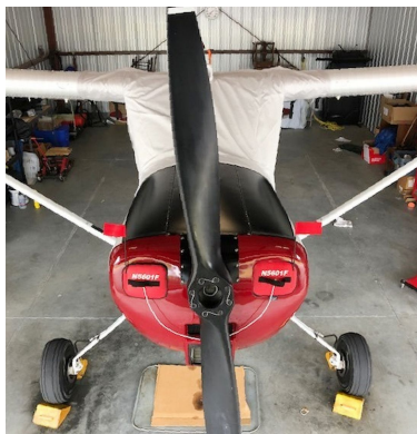
Cessna Bird Dog, L-19, O-1, 305 Engine Inlet Plugs