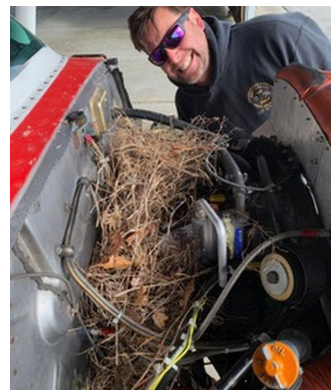
Cessna 172 Bird Nest Problem