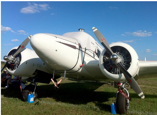
Beech 18 Cockpit Cover & Carb Inlet Plugs

This cover type is made from Silver Acrylic Sunbrella canvas and is 100% lined with a soft and smooth microfiber. Bruce's Custom Covers developed this material combination especially for aircraft protection. The outer material is medium weight and treated for water resistance, UV resistance and anti-static buildup. The inner lining is a very soft and smooth microfiber to prevent scratching. The material is very reflective, and tests show that the cabin interior temperature can be reduced to near-ambient temperature on the hottest of days. It is water, ice and snow repellent, yet breathable to allow moisture to escape from between the cover and the aircraft surface.