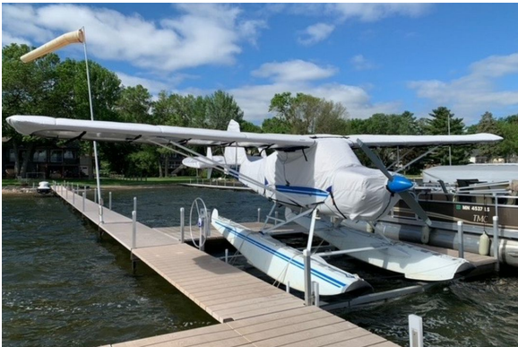
Aeronca 7GC Amphib Cover Set, AFTER

WINTER USE MATERIAL - Made with Solution-Dyed Polyester fabric, this option is intended for seasonal use to aid in deicing, rain mitigation, or for occasional travel. The material is lighter and more compact, but more susceptible to UV damage and may have a shorter useful life if used continuously outside than the all-year use material.