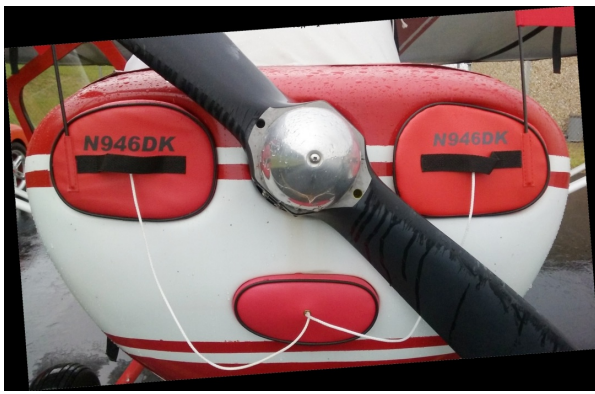
Aeronca Champ Engine Plugs