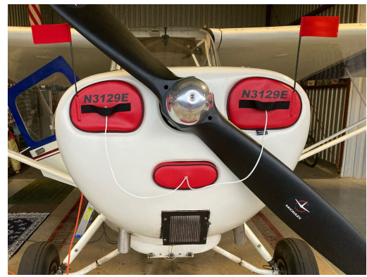
Aeronca Champ Engine Plugs