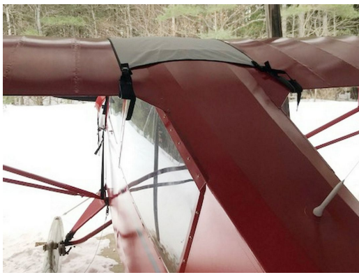
Aeronca Champ Windshield/Skylight Cover