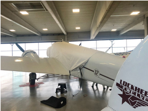
Lockheed 12 Canopy/Nose Cover