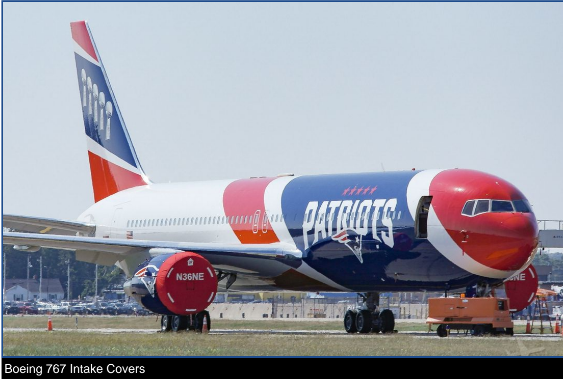
Boeing 767 Intake Covers