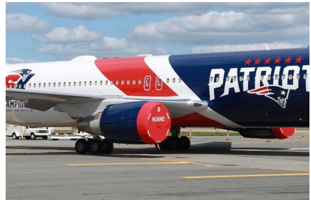
Boeing 767 Intake Covers