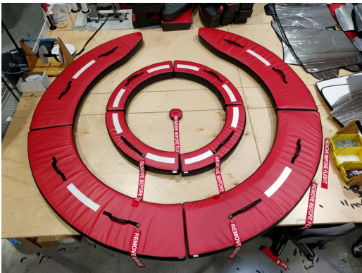
Boeing 747-8 Exhaust Plugs