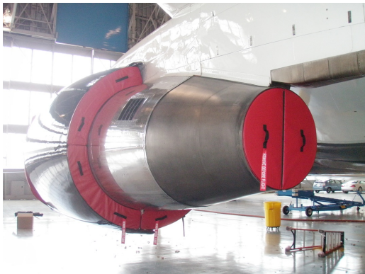
Exhaust Plugs Ship Set, incl. Fan Thrust Reverser and Exhaust Plugs P/N: B767-200

The Engine Inlet Plugs are custom fit for your Boeing KC-46, KC-46A, Pegasus intakes, made with heavy-duty vinyl material, and stuffed with a single block of sculpted urethane foam. Each plug has a zipper that allows the foam to be removed and dried if necessary. Engine plugs have 'remove before flight' streamers sewn onto the face of the plugs. Most plugs are imprinted with the aircraft registration number in black for an extra charge. Storage bag NOT included. Engine plugs may be inserted after flight when the engine is still warm. Engine Inlet Plugs are commonly referred to as Cowl Plugs, Intake Plugs, Cowl Blocks, Engine Blocks, and Engine Bungs.