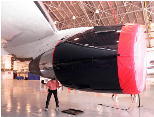
Boeing 767 Intake Covers Ship Set