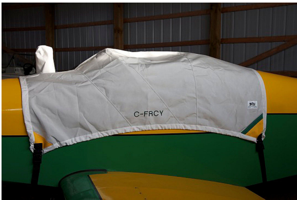
Jodel D9 Bebe Canopy Cover