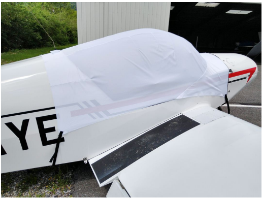
Jodel D113V Canopy Cover, test fit cover