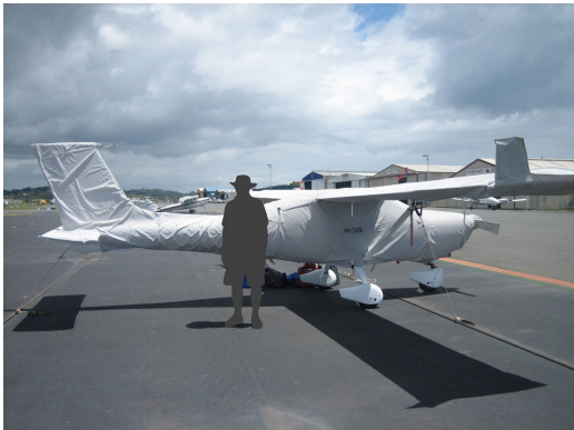
Jabiru J430 Complete Cover Set

This cover type is made from Silver Acrylic Sunbrella canvas and is 100% lined with a soft and smooth microfiber. Bruce's Custom Covers developed this material combination especially for aircraft protection. The outer material is medium weight and treated for water resistance, UV resistance and anti-static buildup. The inner lining is a very soft and smooth microfiber to prevent scratching. The material is very reflective, and tests show that the cabin interior temperature can be reduced to near-ambient temperature on the hottest of days. It is water, ice and snow repellent, yet breathable to allow moisture to escape from between the cover and the aircraft surface.