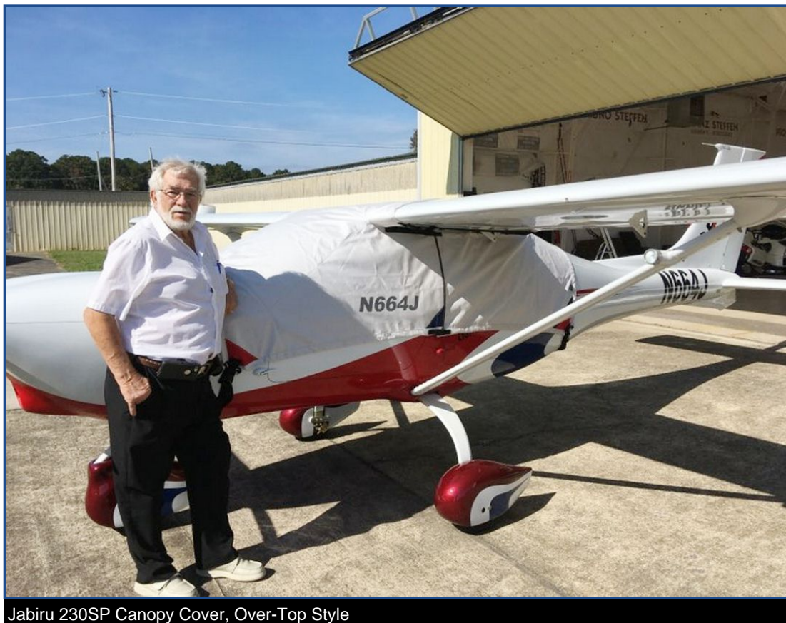
Jabiru 230SP Canopy Cover, Over-Top Style