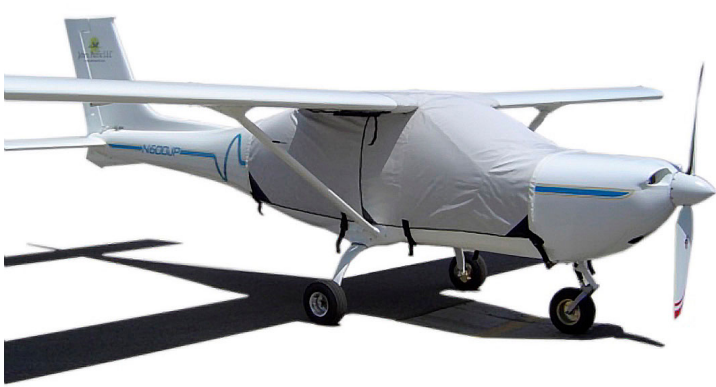
Jabiru Extended Canopy Cover