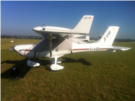
Jabiru 170 Canopy Cover