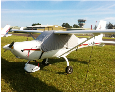
Jabiru 170 Canopy Cover

This cover type is made from Silver Acrylic Sunbrella canvas and is 100% lined with a soft and smooth microfiber. Bruce's Custom Covers developed this material combination especially for aircraft protection. The outer material is medium weight and treated for water resistance, UV resistance and anti-static buildup. The inner lining is a very soft and smooth microfiber to prevent scratching. The material is very reflective, and tests show that the cabin interior temperature can be reduced to near-ambient temperature on the hottest of days. It is water, ice and snow repellent, yet breathable to allow moisture to escape from between the cover and the aircraft surface.