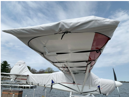
Aviat Husky Canopy, Engine, Wing, Empennage Covers