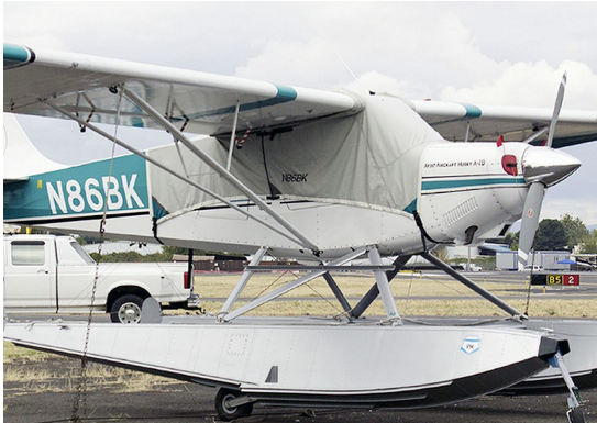
Aviat Husky Canopy Cover and Inlet Plugs

Engine Inlet Plugs are custom fit for your Aviat (Christen) Husky intakes, made with heavy-duty vinyl material, and stuffed with a single block of sculpted urethane foam. Each plug has a zipper that allows the foam to be removed and dried if necessary. Engine plugs have warning flags that are visible from the cockpit or 'remove before flight' streamers sewn onto the face of the plugs. Most plugs are imprinted with the aircraft registration number in black for an extra charge. Storage bag NOT included. Engine plugs may be inserted after flight when the engine is still warm. Engine Inlet Plugs are commonly referred to as Cowl Plugs, Intake Plugs, Cowl Blocks, Engine Blocks, and Engine Bungs.