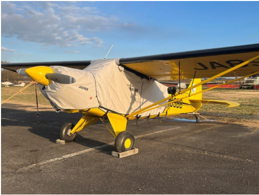
Aviat Husky Extended Canopy Cover, Engine Cover

This cover type is made from Silver Acrylic Sunbrella canvas and is 100% lined with a soft and smooth microfiber. Bruce's Custom Covers developed this material combination especially for aircraft protection. The outer material is medium weight and treated for water resistance, UV resistance and anti-static buildup. The inner lining is a very soft and smooth microfiber to prevent scratching. The material is very reflective, and tests show that the cabin interior temperature can be reduced to near-ambient temperature on the hottest of days. It is water, ice and snow repellent, yet breathable to allow moisture to escape from between the cover and the aircraft surface.