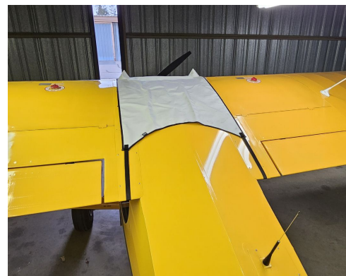
Piper PA-12: Super Cruiser, J5 Cub Windshield/Skylight Cover