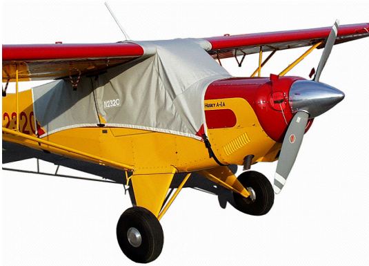
Aviat Husky Canopy Cover & Engine Plugs