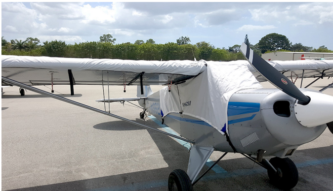
Aviat (Christen) Husky Canopy Cover (Over-The-Top Style)