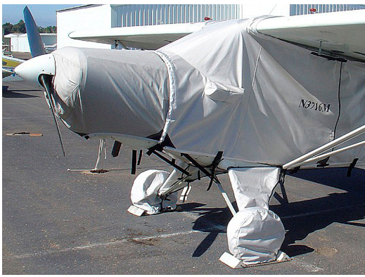
Piper PA-12 Landing Gear Covers