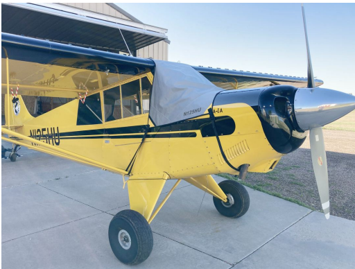
Aviat Husky Windshield/Skylight Cover

This cover type is made from Silver Acrylic Sunbrella canvas and is 100% lined with a soft and smooth microfiber. Bruce's Custom Covers developed this material combination especially for aircraft protection. The outer material is medium weight and treated for water resistance, UV resistance and anti-static buildup. The inner lining is a very soft and smooth microfiber to prevent scratching. The material is very reflective, and tests show that the cabin interior temperature can be reduced to near-ambient temperature on the hottest of days. It is water, ice and snow repellent, yet breathable to allow moisture to escape from between the cover and the aircraft surface.