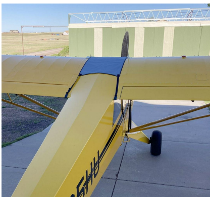
Aviat Husky Windshield/Skylight Cover

This cover type is made from Silver Acrylic Sunbrella canvas and is 100% lined with a soft and smooth microfiber. Bruce's Custom Covers developed this material combination especially for aircraft protection. The outer material is medium weight and treated for water resistance, UV resistance and anti-static buildup. The inner lining is a very soft and smooth microfiber to prevent scratching. The material is very reflective, and tests show that the cabin interior temperature can be reduced to near-ambient temperature on the hottest of days. It is water, ice and snow repellent, yet breathable to allow moisture to escape from between the cover and the aircraft surface.