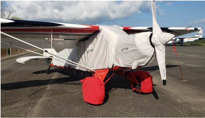
Aviat Husky Extended Canopy Cover, Engine, Prop, Empennage & Tire Covers