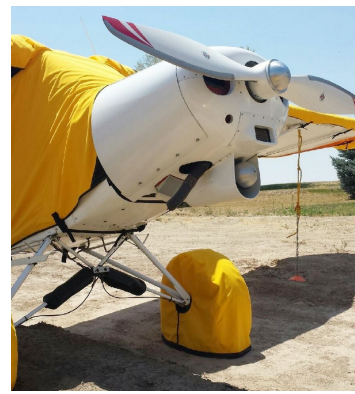
Piper PA-18 Super Cub Extended Canopy Cover, Wing & Tire Covers