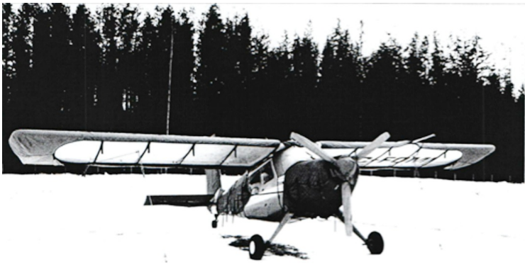
Helio Courier Wing Covers

WINTER USE MATERIAL - Made with Solution-Dyed Polyester fabric, this option is intended for seasonal use to aid in deicing, rain mitigation, or for occasional travel. The material is lighter and more compact, but more susceptible to UV damage and may have a shorter useful life if used continuously outside than the all-year use material.