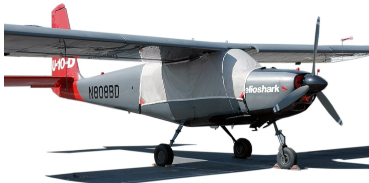
Helio Courier Canopy Cover & Engine Plugx

This cover type is made from Silver Acrylic Sunbrella canvas and is 100% lined with a soft and smooth microfiber. Bruce's Custom Covers developed this material combination especially for aircraft protection. The outer material is medium weight and treated for water resistance, UV resistance and anti-static buildup. The inner lining is a very soft and smooth microfiber to prevent scratching. The material is very reflective, and tests show that the cabin interior temperature can be reduced to near-ambient temperature on the hottest of days. It is water, ice and snow repellent, yet breathable to allow moisture to escape from between the cover and the aircraft surface.