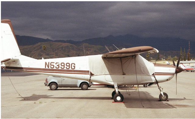
Helio Courier Canopy Cover, over top type

This cover type is made from Silver Acrylic Sunbrella canvas and is 100% lined with a soft and smooth microfiber. Bruce's Custom Covers developed this material combination especially for aircraft protection. The outer material is medium weight and treated for water resistance, UV resistance and anti-static buildup. The inner lining is a very soft and smooth microfiber to prevent scratching. The material is very reflective, and tests show that the cabin interior temperature can be reduced to near-ambient temperature on the hottest of days. It is water, ice and snow repellent, yet breathable to allow moisture to escape from between the cover and the aircraft surface.