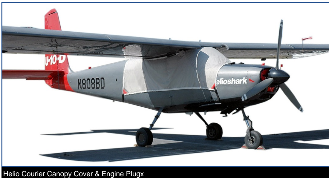
Helio Courier Canopy Cover &amp; Engine Plugx