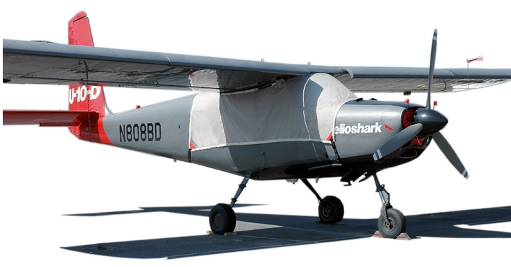
Helio Courier Canopy Cover & Engine Plugx