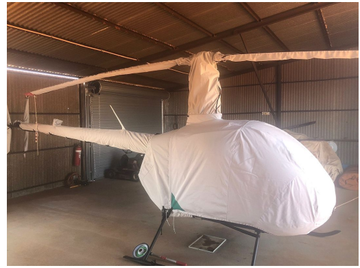
Robinson R-22 Full Cover Set