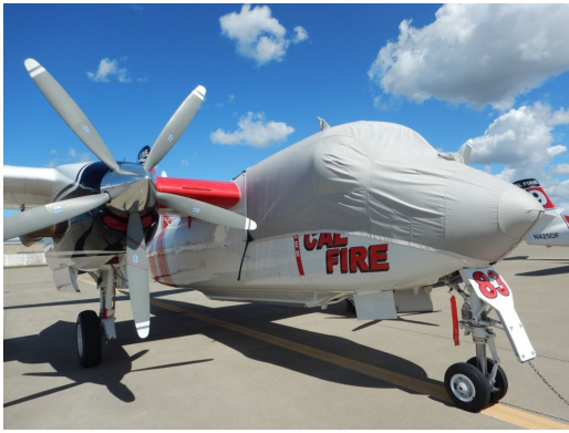
Grumman Tracker Canopy/Nose Cover