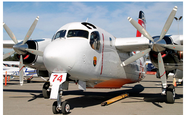
Grumman Tracker Engine Inlet Plugs