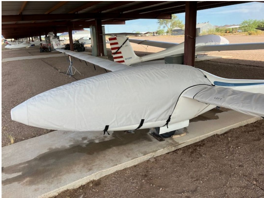
Glasflugel Kestrel Canopy/Nose Cover

water resistance, UV resistance and anti-static buildup. The inner lining is a very soft and smooth microfiber to prevent scratching. The material is very reflective, and tests show that the cabin interior temperature can be reduced to near-ambient temperature on the hottest of days. It is water, ice and snow repellent, yet breathable to allow moisture to escape from between the cover and the aircraft surface.