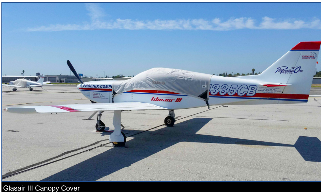
Glasair III Canopy Cover