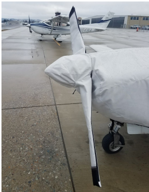
Glasair Aviation Glasair II & III Propellor/Spinner Cover, 2 Blade Glasair Aviation Glasair II & III Propellor/Spinner Cover, 2 Blade