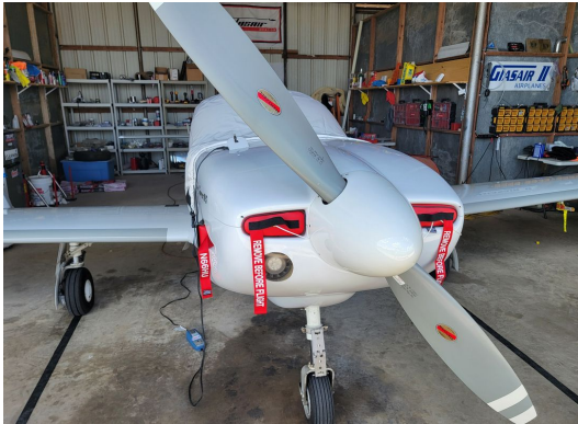
GLASAIR S2-RG Canopy Cover, Engine Plugs