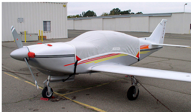
Glasair II/III Canopy Cover & Plugs