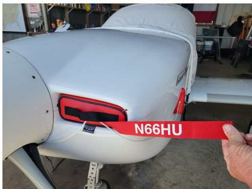
GLASAIR S2-RG Canopy Cover, Engine Plugs

Engine Inlet Plugs are custom fit for your Glasair Aviation Glasair II & III intakes, made with heavy-duty vinyl material, and stuffed with a single block of sculpted urethane foam. Each plug has a zipper that allows the foam to be removed and dried if necessary. Engine plugs have warning flags that are visible from the cockpit or 'remove before flight' streamers sewn onto the face of the plugs. Most plugs are imprinted with the aircraft registration number in black for an extra charge. Storage bag NOT included. Engine plugs may be inserted after flight when the engine is still warm. Engine Inlet Plugs are commonly referred to as Cowl Plugs, Intake Plugs, Cowl Blocks, Engine Blocks, and Engine Bungs.