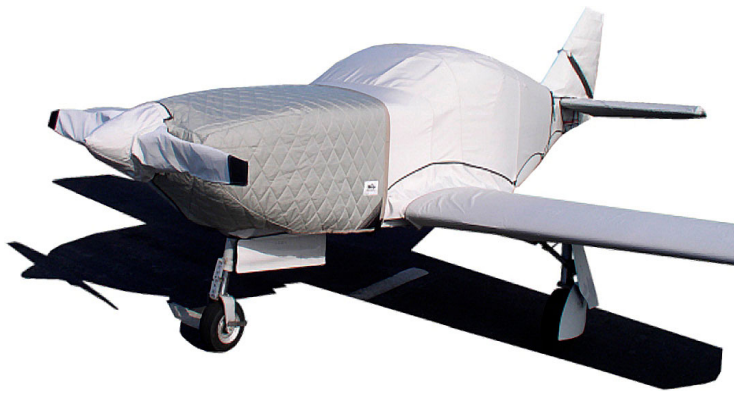
Glasair I Insulated Engine Cover, Prop Cover, Etc.