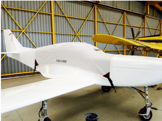
Glasair II/III Canopy Cover

This cover type is made from Silver Acrylic Sunbrella canvas and is 100% lined with a soft and smooth microfiber. Bruce's Custom Covers developed this material combination especially for aircraft protection. The outer material is medium weight and treated for water resistance, UV resistance and anti-static buildup. The inner lining is a very soft and smooth microfiber to prevent scratching. The material is very reflective, and tests show that the cabin interior temperature can be reduced to near-ambient temperature on the hottest of days. It is water, ice and snow repellent, yet breathable to allow moisture to escape from between the cover and the aircraft surface.