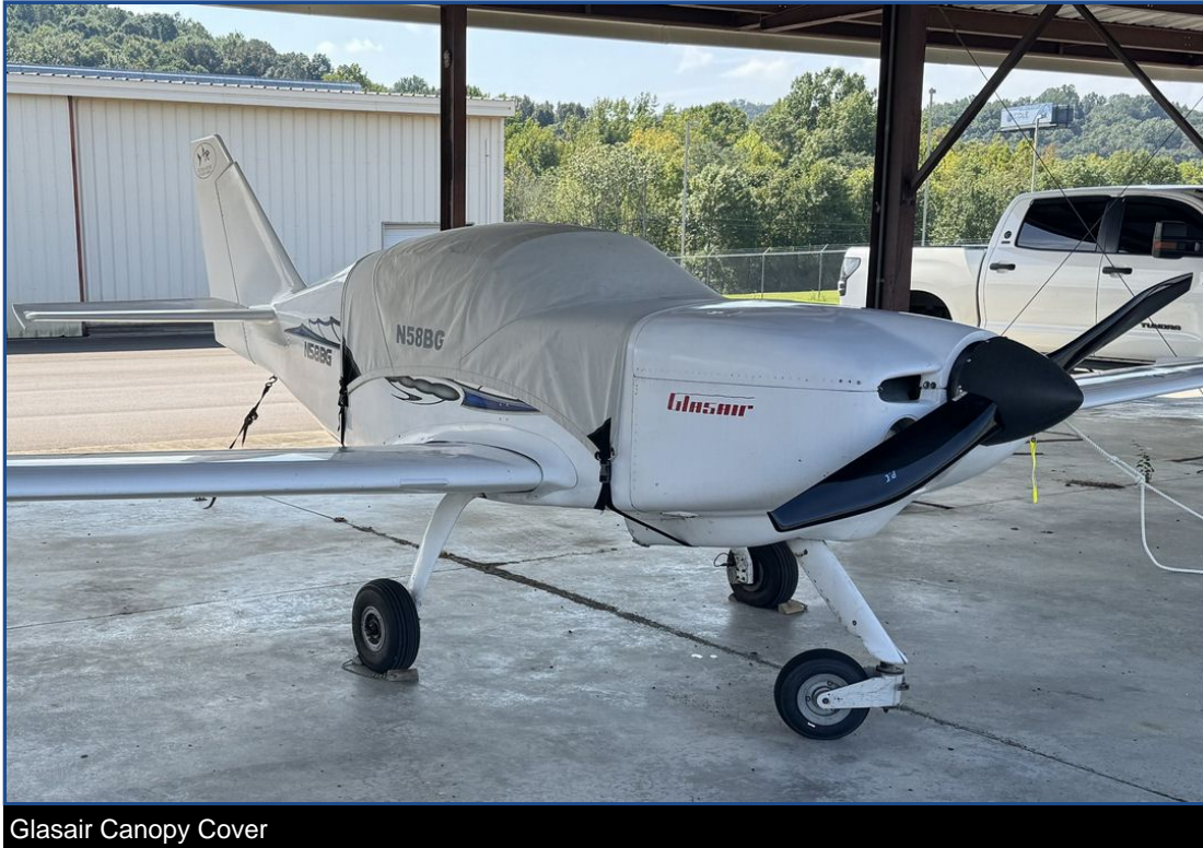
Glasair Canopy Cover