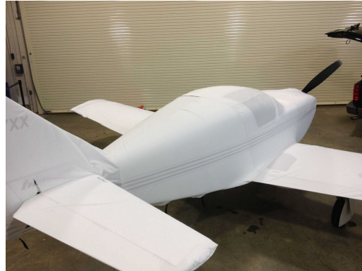
Glasair Aviation Glasair I Complete Fuselage Cover W/Detachable Wing Covers