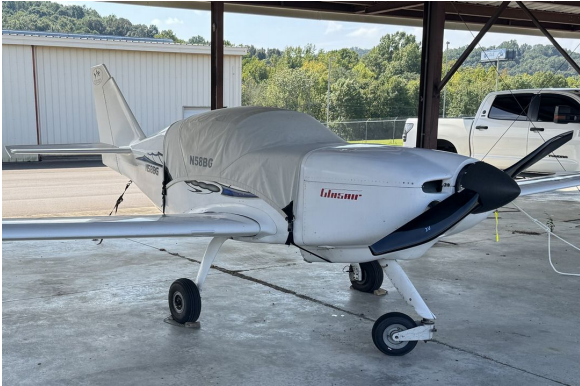
Glasair Canopy Cover

This cover type is made from Silver Acrylic Sunbrella canvas and is 100% lined with a soft and smooth microfiber. Bruce's Custom Covers developed this material combination especially for aircraft protection. The outer material is medium weight and treated for water resistance, UV resistance and anti-static buildup. The inner lining is a very soft and smooth microfiber to prevent scratching. The material is very reflective, and tests show that the cabin interior temperature can be reduced to near-ambient temperature on the hottest of days. It is water, ice and snow repellent, yet breathable to allow moisture to escape from between the cover and the aircraft surface.