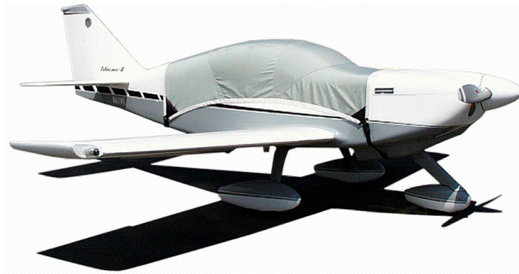
Canopy Cover for the Glasair I

Travel Covers are made with Silver Solution-Dyed Polyester fabric and only lined over the windshield to save weight. The material is lightweight and more compact for easy stowage in the aircraft. The polyester material is water resistant, but only intended for occasional use outside. We also have an ultra lightweight material available for fitted hangar dust covers. For daily outdoor use, the non-travel Sunbrella Cover is the best choice.