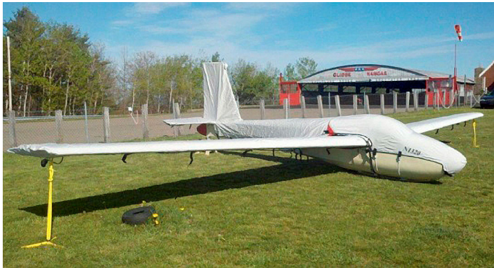
Schweizer 1-26B Canopy/Nose, Empennage & Wing Covers