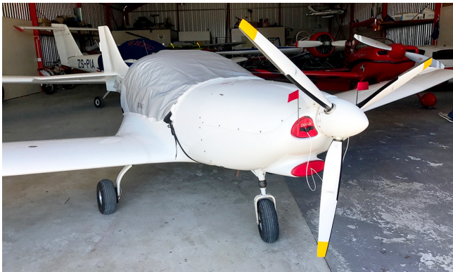
Gobosh 800XP Travel Cover, Light Weight Travel Canopy Cover and Inlet Plugs

Engine Inlet Plugs are custom fit for your Gobosh 800XP intakes, made with heavy-duty vinyl material, and stuffed with a single block of sculpted urethane foam. Each plug has a zipper that allows the foam to be removed and dried if necessary. Engine plugs have warning flags that are visible from the cockpit or 'remove before flight' streamers sewn onto the face of the plugs. Most plugs are imprinted with the aircraft registration number in black for an extra charge. Storage bag NOT included. Engine plugs may be inserted after flight when the engine is still warm. Engine Inlet Plugs are commonly referred to as Cowl Plugs, Intake Plugs, Cowl Blocks, Engine Blocks, and Engine Bungs.