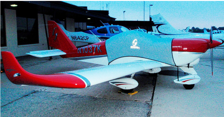
Gobosh Light Weight Travel-Cover