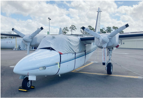
Aero Commander 500S Shrike Canopy, Engine & Prop Covers

The material is very reflective, and tests show that the cabin interior temperature can be reduced to near-ambient temperature on the hottest of days. It is water, ice and snow repellent, yet breathable to allow moisture to escape from between the cover and the aircraft surface.