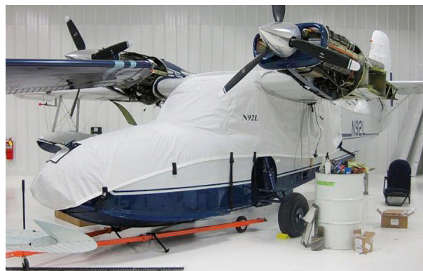
Grumman G44 Widgeon Canopy/Nose Cover