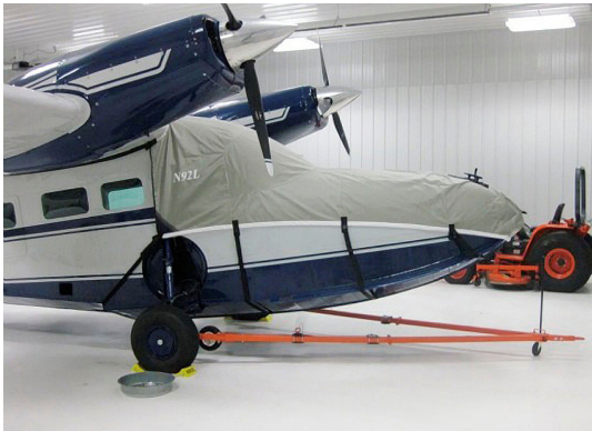
Grumman G44 Widgeon Cockpit/Nose Cover

This cover type is made from Silver Acrylic Sunbrella canvas and is 100% lined with a soft and smooth microfiber. Bruce's Custom Covers developed this material combination especially for aircraft protection. The outer material is medium weight and treated for water resistance, UV resistance and anti-static buildup. The inner lining is a very soft and smooth microfiber to prevent scratching. The material is very reflective, and tests show that the cabin interior temperature can be reduced to near-ambient temperature on the hottest of days. It is water, ice and snow repellent, yet breathable to allow moisture to escape from between the cover and the aircraft surface.