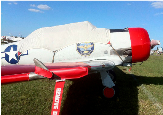
T6 Pitot, Canopy & Prop Covers

Grumman Widgeon G-44 Pitot Tube Covers , NOT HEAT RESISTANT TYPE, are made of Naugahyde vinyl, and are designed to cover the entire pitot assembly. Slipping over the tube, the cover tightens around the base with a Velcro strap detail. A "Remove Before Flight" streamer is attached to the cover. Heat Resistant Pitot Covers are an upgrade to this design, and help prevent the pitot cover from melting onto the tube if the pitot heat is accidentally turned on while installed. If you want the set tethered together, please let us know.