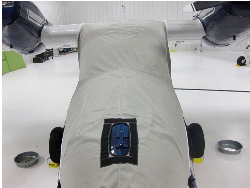
Grumman Widgeon Cockpit/Nose Cover, tie-down cleat detail