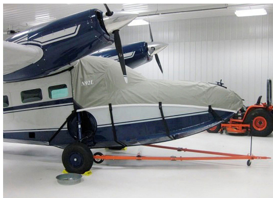
Grumman G44 Widgeon Cockpit/Nose Cover

Travel Covers are made with Silver Solution-Dyed Polyester fabric and only lined over the windshield to save weight. The material is lightweight and more compact for easy stowage in the aircraft. The polyester material is water resistant, but only intended for occasional use outside. We also have an ultra lightweight material available for fitted hangar dust covers. For daily outdoor use, the non-travel Sunbrella Cover is the best choice.