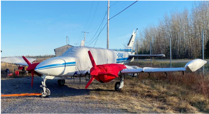
Cessna 340A Extended Canopy, Wing, Insulated Engine & Prop Covers