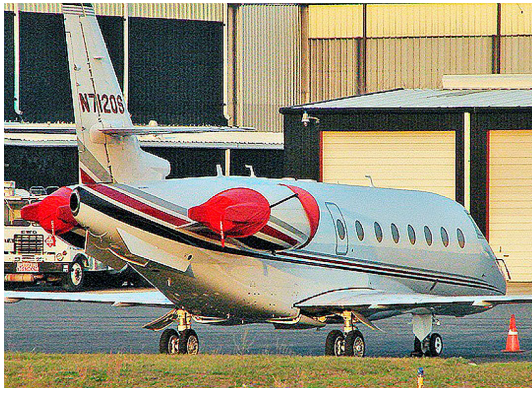
Gulfstream 200 Engine Cover set