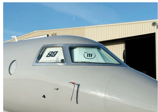
Gulfstream G200 Cockpit Heatshields