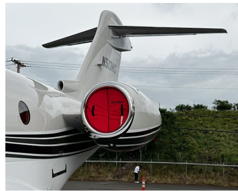
Gulfstream G280 Intake Plugs