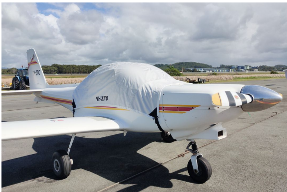
Grob 115 Canopy Cover