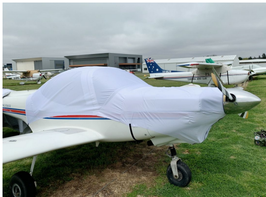
Grob 115 Canopy/Engine Cover, test fit cover

The Grob 115 Canopy/Engine Cover is a one-piece cover (100% lined with microfiber) that is a combination of the Canopy Cover and Engine Cover. This cover will enclose the engine cowl and will extend aft to cover all of the windows. This cover type is made from Silver Acrylic Sunbrella canvas and is 100% lined with a soft and smooth microfiber. Bruce's Custom Covers developed this material combination especially for aircraft protection. The outer material is medium weight and treated for water resistance, UV resistance and anti-static buildup. The inner lining is a very soft and smooth microfiber to prevent scratching. The material is very reflective, and tests show that the cabin interior temperature can be reduced to near-ambient temperature on the hottest of days. It is water, ice and snow repellent, yet breathable to allow moisture to escape from between the cover and the aircraft surface.