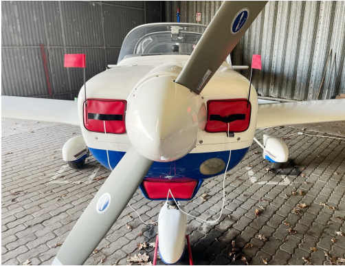
Grob 115 Engine Inlet Plugs, Incl. Carb. Inlet Plug

Engine Inlet Plugs are custom fit for your Grob 115 intakes, made with heavy-duty vinyl material, and stuffed with a single block of sculpted urethane foam. Each plug has a zipper that allows the foam to be removed and dried if necessary. Engine plugs have warning flags that are visible from the cockpit or 'remove before flight' streamers sewn onto the face of the plugs. Most plugs are imprinted with the aircraft registration number in black for an extra charge. Storage bag NOT included. Engine plugs may be inserted after flight when the engine is still warm. Engine Inlet Plugs are commonly referred to as Cowl Plugs, Intake Plugs, Cowl Blocks, Engine Blocks, and Engine Bungs.