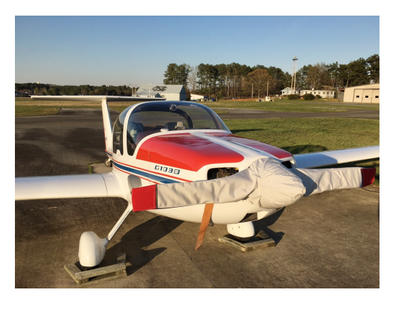
Grob 109 Prop Cover