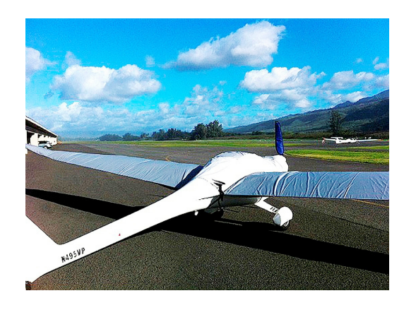
Lambada Canopy/Engine Cover and Wing Covers