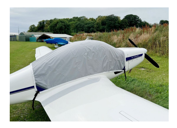
Grob 109 Travel Cover, Light Weight Canopy Cover