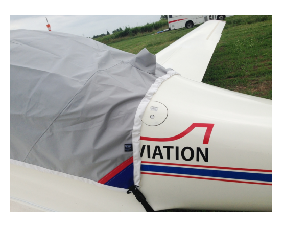
Grob 109 Travel Cover, Light Weight Travel Canopy Cover