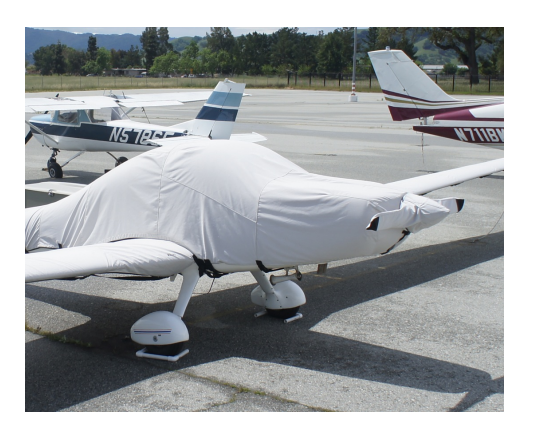
Grob 109 Prop Cover