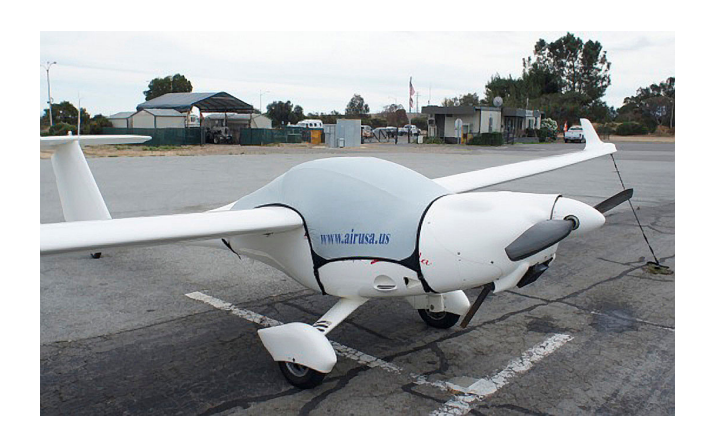
Lambada Travel Canopy Cover