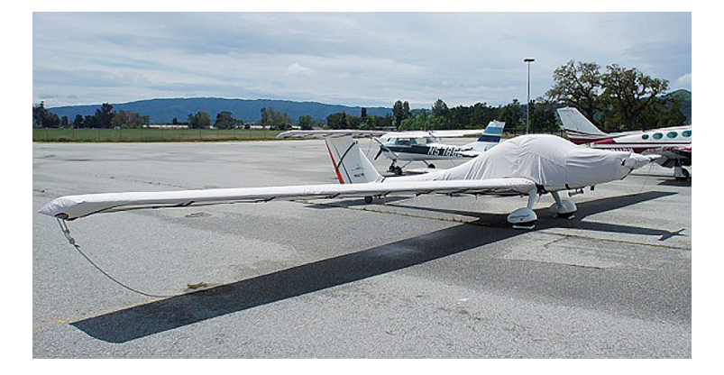
Grob 109 Horizontal Stabilizer Cover