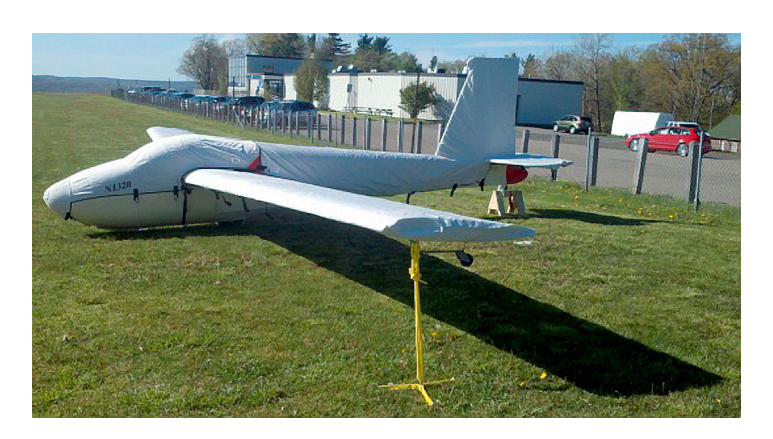
SGS 1-26B Canopy/Nose, Empennage & Wing Covers