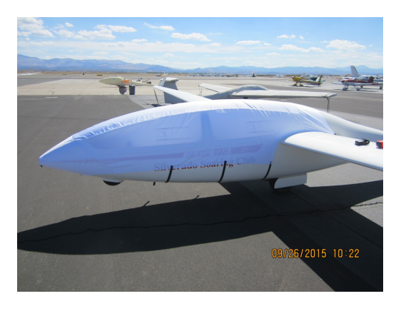
DG-505 Canopy/Nose Cover (test fit cover)

This cover type is made from Silver Acrylic Sunbrella canvas and is 100% lined with a soft and smooth microfiber. Bruce's Custom Covers developed this material combination especially for aircraft protection. The outer material is medium weight and treated for water resistance, UV resistance and anti-static buildup. The inner lining is a very soft and smooth microfiber to prevent scratching. The material is very reflective, and tests show that the cabin interior temperature can be reduced to near-ambient temperature on the hottest of days. It is water, ice and snow repellent, yet breathable to allow moisture to escape from between the cover and the aircraft surface.