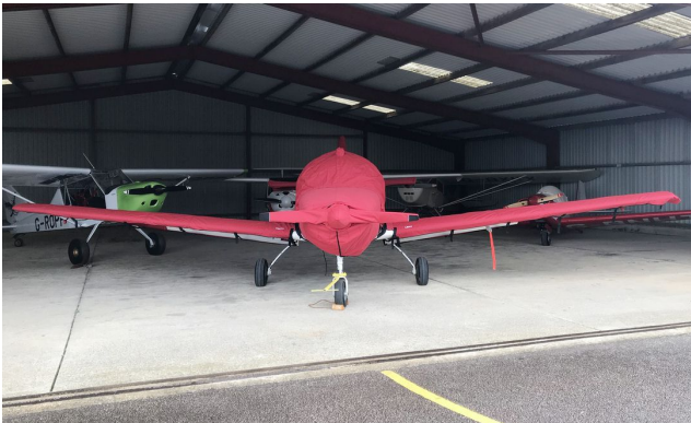
FLS Club Sprint Empennage Cover (Tailboom, Vertical & Horiz Stabilizers) All Year Use