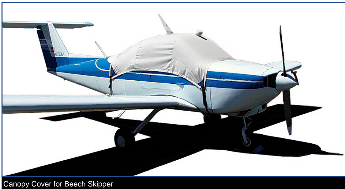
Canopy Cover for Beech Skipper