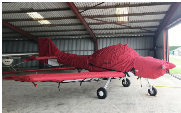
FLS Club Sprint Extended Canopy Cover