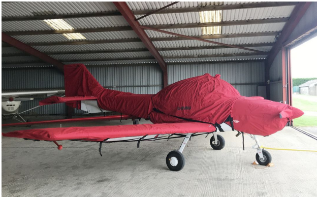
FLS Club Sprint Extended Canopy Cover

Covers developed this material combination especially for aircraft protection. The outer material is medium weight and treated for water resistance, UV resistance and anti-static buildup. The inner lining is a very soft and smooth microfiber to prevent scratching. The material is very reflective, and tests show that the cabin interior temperature can be reduced to near-ambient temperature on the hottest of days. It is water, ice and snow repellent, yet breathable to allow moisture to escape from between the cover and the aircraft surface.