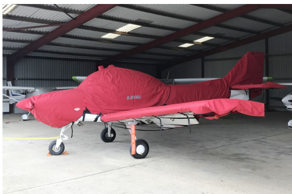
FLS Club Sprint Engine Cover

WINTER USE MATERIAL - Made with Solution-Dyed Polyester fabric, this option is intended for seasonal use to aid in deicing, rain mitigation, or for occasional travel. The material is lighter and more compact, but more susceptible to UV damage and may have a shorter useful life if used continuously outside than the all-year use material.