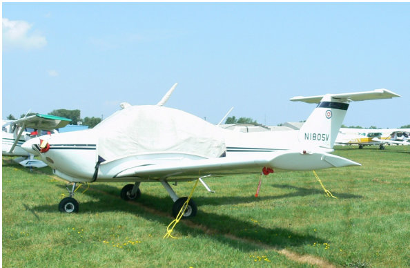
Beech Skipper Canopy Cover, Engine Plugs