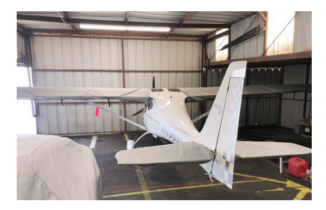
FK 9 MARK IV Wing & Horizontal Stabilizer Dust Covers

FK-Lightplanes FK-9 Canopy & Engine Covers, test fit covers