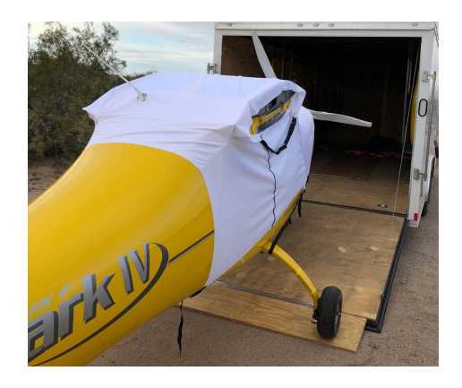
FK-Lightplanes FK-9 Canopy Cover, test fit cover

FK-Lightplanes FK-9 Canopy & Engine Covers, test fit covers