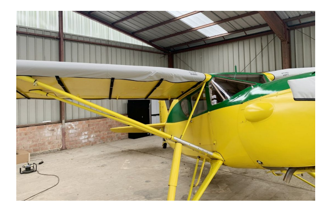
Fairchild 24 Wing Covers