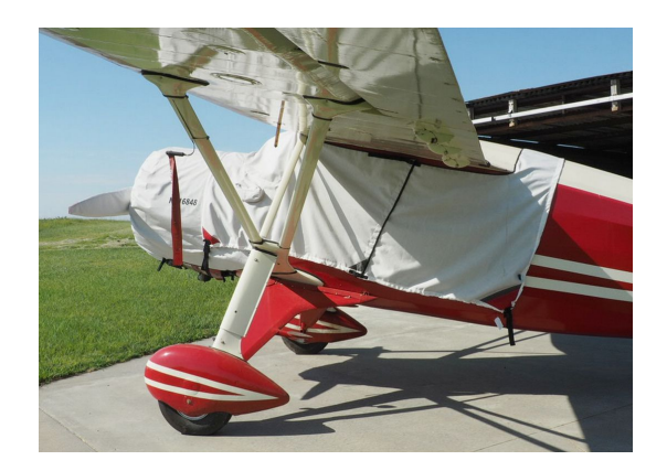
Fairchild 24W Canopy & Engine Cover

This cover type is made from Silver Acrylic Sunbrella canvas and is 100% lined with a soft and smooth microfiber. Bruce's Custom Covers developed this material combination especially for aircraft protection. The outer material is medium weight and treated for water resistance, UV resistance and anti-static buildup. The inner lining is a very soft and smooth microfiber to prevent scratching. The material is very reflective, and tests show that the cabin interior temperature can be reduced to near-ambient temperature on the hottest of days. It is water, ice and snow repellent, yet breathable to allow moisture to escape from between the cover and the aircraft surface.