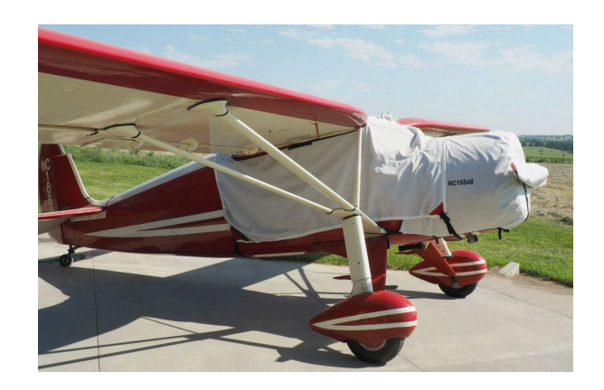
Fairchild 24W Canopy, Engine & Prop Cover