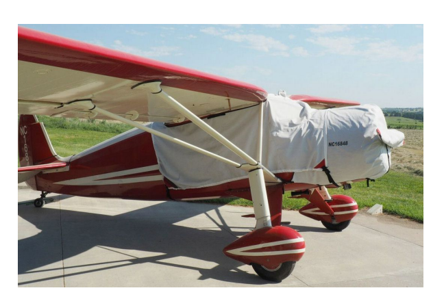
Fairchild 24W Canopy, Engine & Prop Cover