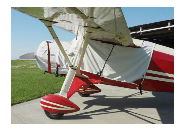
Fairchild 24W Canopy & Engine Cover

This cover type is made from Silver Acrylic Sunbrella canvas and is 100% lined with a soft and smooth microfiber. Bruce's Custom Covers developed this material combination especially for aircraft protection. The outer material is medium weight and treated for water resistance, UV resistance and anti-static buildup. The inner lining is a very soft and smooth microfiber to prevent scratching. The material is very reflective, and tests show that the cabin interior temperature can be reduced to near-ambient temperature on the hottest of days. It is water, ice and snow repellent, yet breathable to allow moisture to escape from between the cover and the aircraft surface.