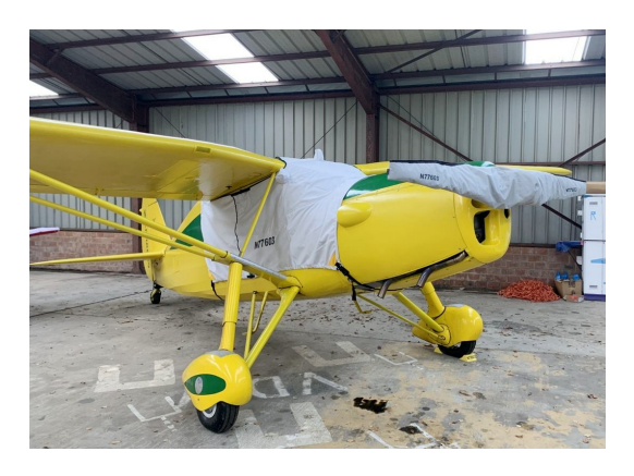
Fairchild 24 Over-Top Canopy Cover