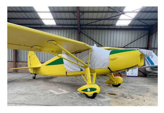
Fairchild 24 Over-Top Canopy Cover, Prop Cover

non-travel Sunbrella Cover is the best choice.