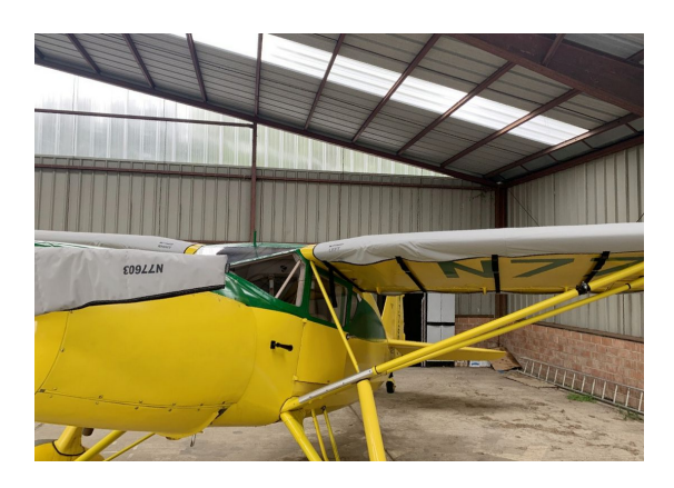
Fairchild 24 Wing Covers