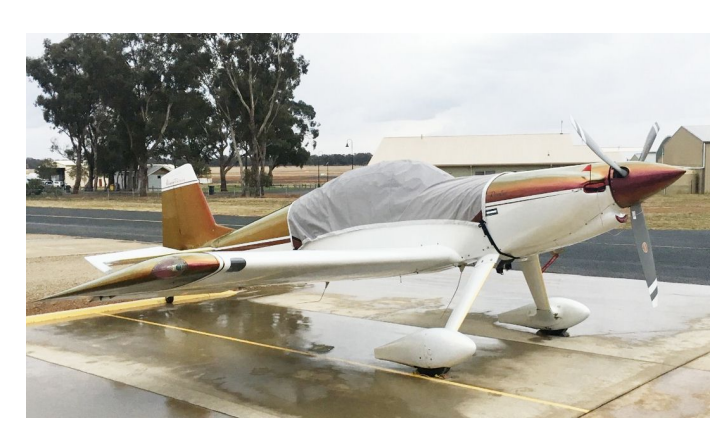
F1 Rocket Travel Cover, Light Weight Travel Canopy Cover, Bubble Windshield, Engine Plugs