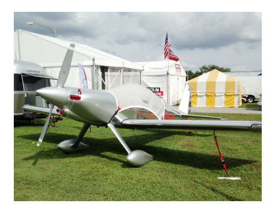
F1 Rocket Canopy Cover, Engine Plugs

Engine Inlet Plugs are custom fit for your Team Rocket F1 Rocket intakes, made with heavy-duty vinyl material, and stuffed with a single block of sculpted urethane foam. Each plug has a zipper that allows the foam to be removed and dried if necessary. Engine plugs have warning flags that are visible from the cockpit or 'remove before flight' streamers sewn onto the face of the plugs. Most plugs are imprinted with the aircraft registration number in black for an extra charge. Storage bag NOT included. Engine plugs may be inserted after flight when the engine is still warm. Engine Inlet Plugs are commonly referred to as Cowl Plugs, Intake Plugs, Cowl Blocks, Engine Blocks, and Engine Bungs.