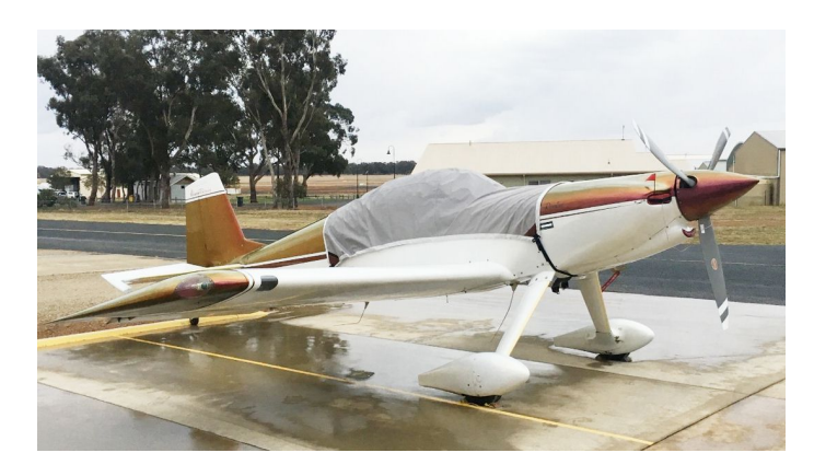
F1 Rocket Travel Cover, Light Weight Travel Canopy Cover, Bubble Windshield, Engine Plugs