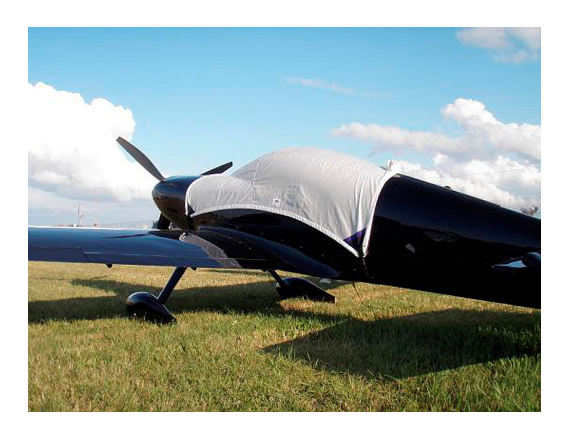
Harmon Rocket Canopy Cover

Travel Covers are made with Silver Solution-Dyed Polyester fabric and only lined over the windshield to save weight. The material is lightweight and more compact for easy stowage in the aircraft. The polyester material is water resistant, but only intended for occasional use outside. We also have an ultra lightweight material available for fitted hangar dust covers. For daily outdoor use, the non-travel Sunbrella Cover is the best choice.