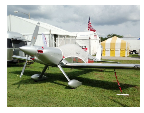
F1 Rocket Canopy Cover, Engine Plugs

This cover type is made from Silver Acrylic Sunbrella canvas and is 100% lined with a soft and smooth microfiber. Bruce's Custom Covers developed this material combination especially for aircraft protection. The outer material is medium weight and treated for water resistance, UV resistance and anti-static buildup. The inner lining is a very soft and smooth microfiber to prevent scratching. The material is very reflective, and tests show that the cabin interior temperature can be reduced to near-ambient temperature on the hottest of days. It is water, ice and snow repellent, yet breathable to allow moisture to escape from between the cover and the aircraft surface.