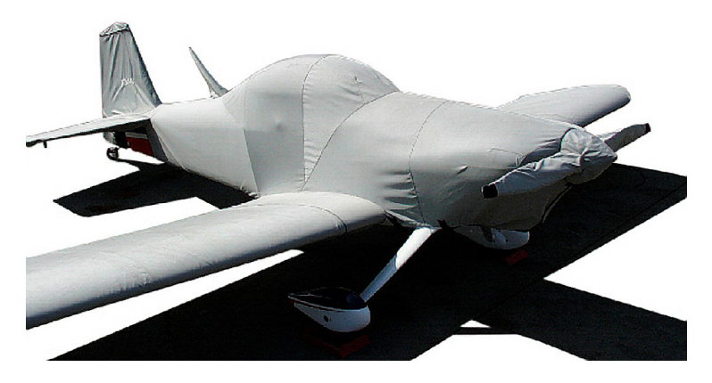
Van's RV-4 Complete Cover