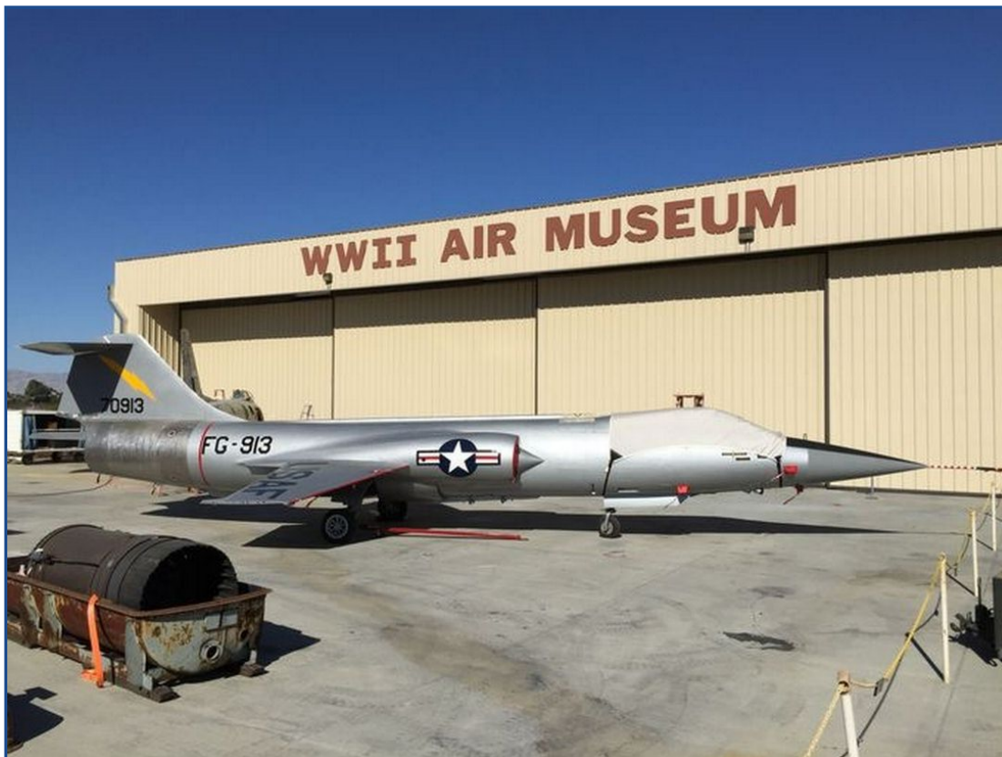
Lockheed F-104 Starfighter Canopy Cover, Single Seat Model