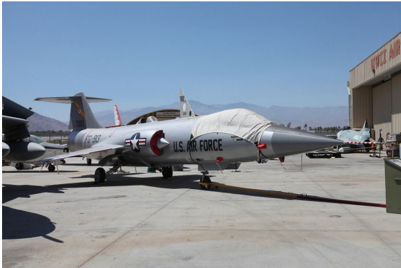
Lockheed F104 Canopy Cover, Intake Plugs