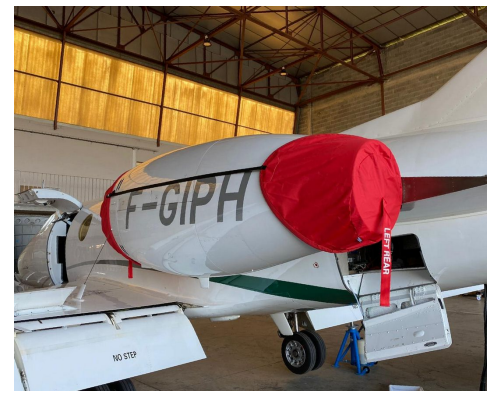
Falcon 10 Engine Covers, no TR's