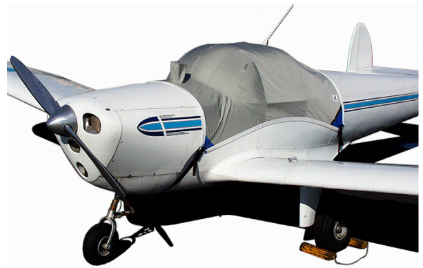
Ercoupe Canopy Cover, bubble windshield model