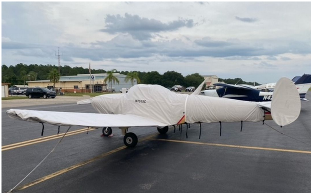
Ercoupe Complete Cover Set