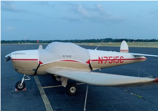
Ercoupe Canopy Cover

This cover type is made from Silver Acrylic Sunbrella canvas and is 100% lined with a soft and smooth microfiber. Bruce's Custom Covers developed this material combination especially for aircraft protection. The outer material is medium weight and treated for water resistance, UV resistance and anti-static buildup. The inner lining is a very soft and smooth microfiber to prevent scratching. The material is very reflective, and tests show that the cabin interior temperature can be reduced to near-ambient temperature on the hottest of days. It is water, ice and snow repellent, yet breathable to allow moisture to escape from between the cover and the aircraft surface.