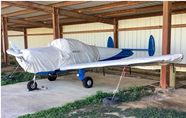
Ercoupe 415-C Wing Covers, All Year Use (set of 2)

WINTER USE MATERIAL - Made with Solution-Dyed Polyester fabric, this option is intended for seasonal use to aid in deicing, rain mitigation, or for occasional travel. The material is lighter and more compact, but more susceptible to UV damage and may have a shorter useful life if used continuously outside than the all-year use material.