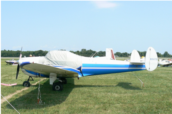
Ercoupe Canopy Cover, flat windshield model