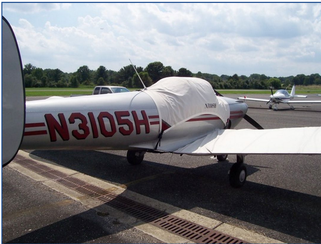
Ercoupe Canopy Cover