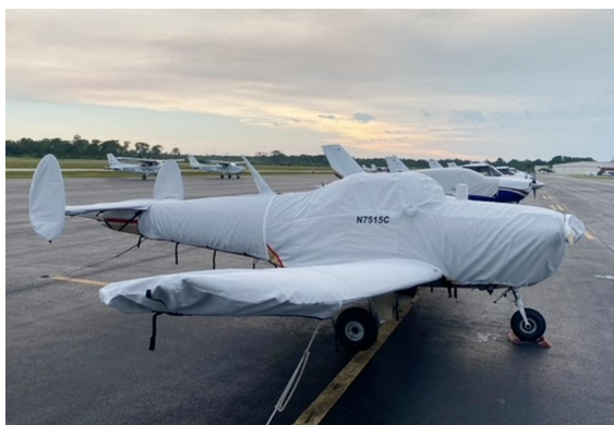
Ercoupe Complete Cover Set