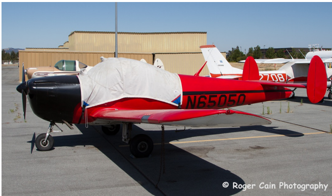
Ercoupe Canopy Cover

Travel Covers are made with Silver Solution-Dyed Polyester fabric and only lined over the windshield to save weight. The material is lightweight and more compact for easy stowage in the aircraft. The polyester material is water resistant, but only intended for occasional use outside. We also have an ultra lightweight material available for fitted hangar dust covers. For daily outdoor use, the non-travel Sunbrella Cover is the best choice.