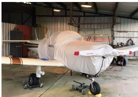
Ercoupe Extended Canopy/Engine & Prop Cover