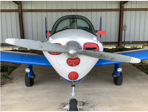
Ercoupe Engine Inlet Plugs