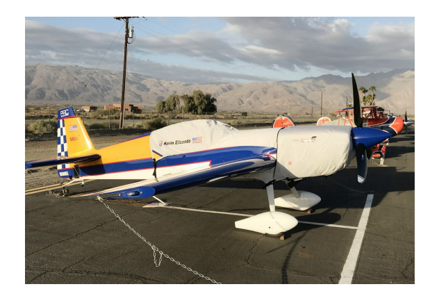
Extra 300S Canopy & Engine Covers

This cover type is made from Silver Acrylic Sunbrella canvas and is 100% lined with a soft and smooth microfiber. Bruce's Custom Covers developed this material combination especially for aircraft protection. The outer material is medium weight and treated for water resistance, UV resistance and anti-static buildup. The inner lining is a very soft and smooth microfiber to prevent scratching. The material is very reflective, and tests show that the cabin interior temperature can be reduced to near-ambient temperature on the hottest of days. It is water, ice and snow repellent, yet breathable to allow moisture to escape from between the cover and the aircraft surface.