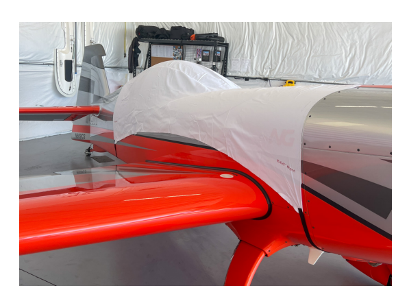
Extra NG Canopy Cover, Single Place Model, test fit cover