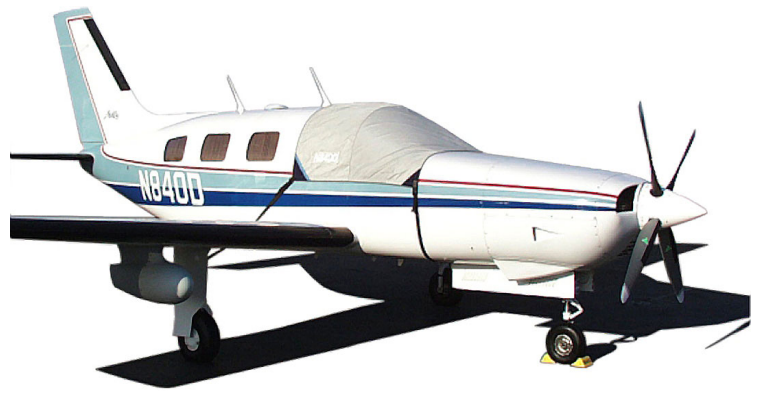
Piper Malibu/Mirage Windshield Cover