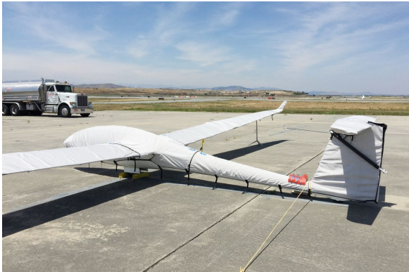
Schempp-Hirth Discus 2B Full Cover Set