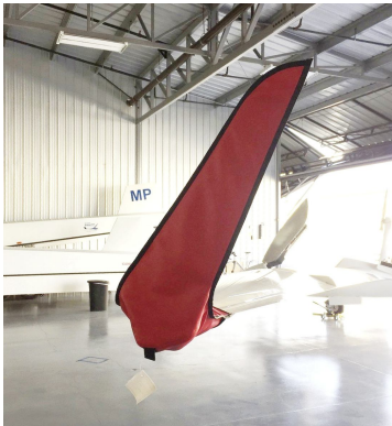
Schleicher ASH Wingtip Pads