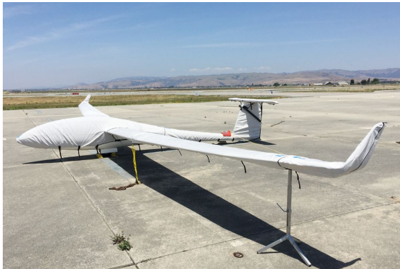
Schempp-Hirth Discus 2B Full Cover Set