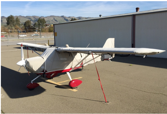
Eurofox Canopy, Engine, Wings and Empennage Covers

WINTER USE MATERIAL - Made with Solution-Dyed Polyester fabric, this option is intended for seasonal use to aid in deicing, rain mitigation, or for occasional travel. The material is lighter and more compact, but more susceptible to UV damage and may have a shorter useful life if used continuously outside than the all-year use material.