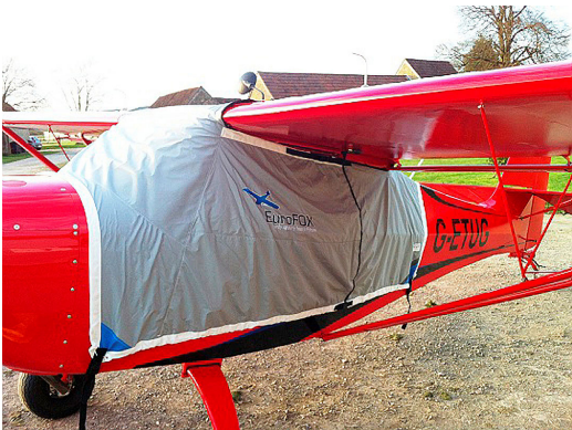
EuroFox and Aerotrek A240 Lightweight Travel Canopy Cover

Travel Covers are made with Silver Solution-Dyed Polyester fabric and only lined over the windshield to save weight. The material is lightweight and more compact for easy stowage in the aircraft. The polyester material is water resistant, but only intended for occasional use outside. We also have an ultra lightweight material available for fitted hangar dust covers. For daily outdoor use, the non-travel Sunbrella Cover is the best choice.