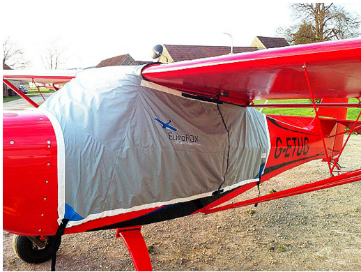
EuroFox and Aerotrek A240 Lightweight Travel Canopy Cover