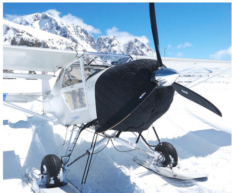
Kitfox Insulated Engine Cover

This cover type is made from Silver Acrylic Sunbrella canvas and is 100% lined with a soft and smooth microfiber. Bruce's Custom Covers developed this material combination especially for aircraft protection. The outer material is medium weight and treated for water resistance, UV resistance and anti-static buildup. The inner lining is a very soft and smooth microfiber to prevent scratching. The material is very reflective, and tests show that the cabin interior temperature can be reduced to near-ambient temperature on the hottest of days. It is water, ice and snow repellent, yet breathable to allow moisture to escape from between the cover and the aircraft surface.