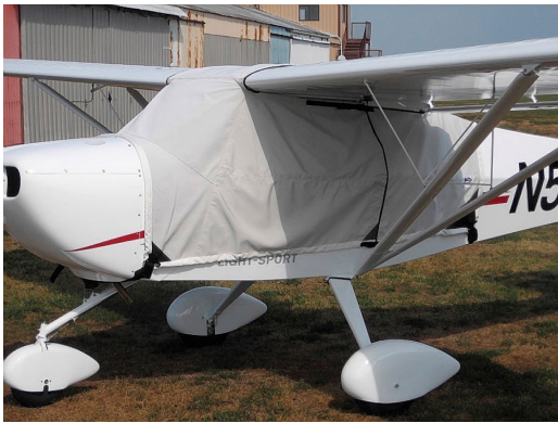
Aerotrek A240 Standard Canopy Cover

This cover type is made from Silver Acrylic Sunbrella canvas and is 100% lined with a soft and smooth microfiber. Bruce's Custom Covers developed this material combination especially for aircraft protection. The outer material is medium weight and treated for water resistance, UV resistance and anti-static buildup. The inner lining is a very soft and smooth microfiber to prevent scratching. The material is very reflective, and tests show that the cabin interior temperature can be reduced to near-ambient temperature on the hottest of days. It is water, ice and snow repellent, yet breathable to allow moisture to escape from between the cover and the aircraft surface.