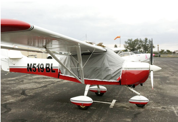
EUROFOX Light Weight Travel Canopy Cover