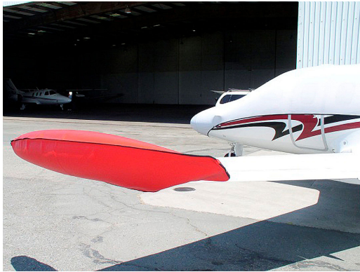
Eclipse Tip Tank Cover

Designed to prevent damage to the aircraft extremities in crowded hangars, these products are made of bright red Naugahyde and thickly padded with a sandwich of closed cell foam.