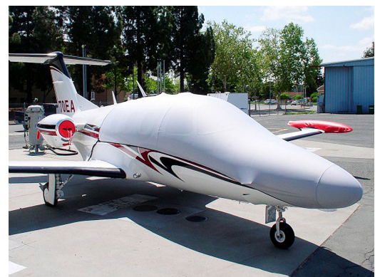
Eclipse Light Weight Travel Cover & Engine Plugs