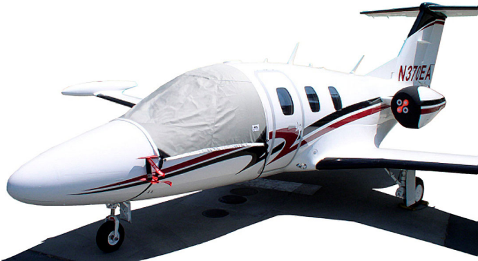
Eclipse Windshield Cover, Pitot Covers & "Bikini" style Engine Covers