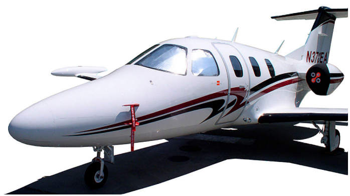
Cockpit HeatShields, Pitot Covers & "Bikini" style Engine Covers