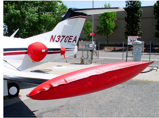
Eclipse Tip Tank & Engine Covers