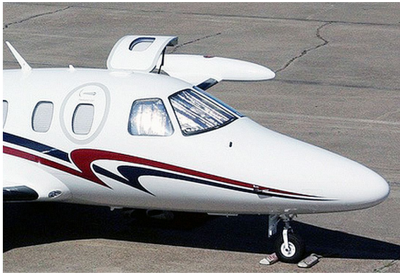
Eclipse Cockpit Heatshields