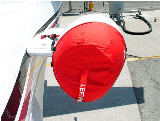
Eclipse Exhaust Cover & Pylon Wedge Plugs