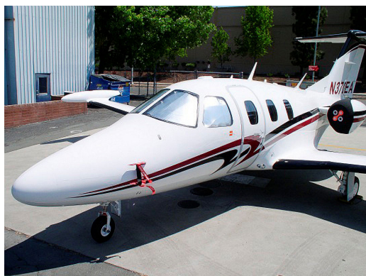
Eclipse Pitot Cover & Bikini Type Engine Covers

This cover type is made from Silver Acrylic Sunbrella canvas and is 100% lined with a soft and smooth microfiber. Bruce's Custom Covers developed this material combination especially for aircraft protection. The outer material is medium weight and treated for water resistance, UV resistance and anti-static buildup. The inner lining is a very soft and smooth microfiber to prevent scratching. The material is very reflective, and tests show that the cabin interior temperature can be reduced to near-ambient temperature on the hottest of days. It is water, ice and snow repellent, yet breathable to allow moisture to escape from between the cover and the aircraft surface.