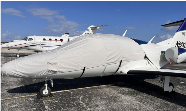
Eclipse EA500 Canopy/Nose Cover

This cover type is made from Silver Acrylic Sunbrella canvas and is 100% lined with a soft and smooth microfiber. Bruce's Custom Covers developed this material combination especially for aircraft protection. The outer material is medium weight and treated for water resistance, UV resistance and anti-static buildup. The inner lining is a very soft and smooth microfiber to prevent scratching. The material is very reflective, and tests show that the cabin interior temperature can be reduced to near-ambient temperature on the hottest of days. It is water, ice and snow repellent, yet breathable to allow moisture to escape from between the cover and the aircraft surface.