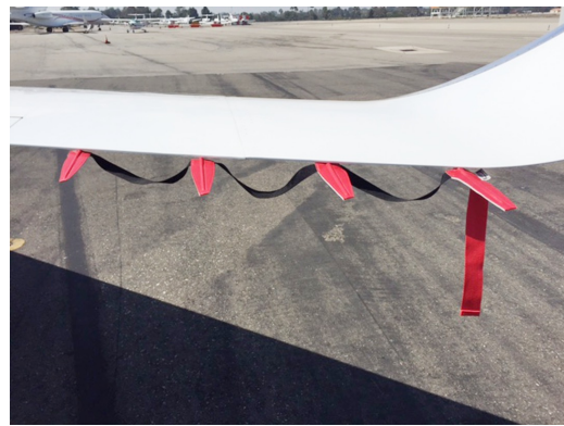
Citation X Static Wick Protectors