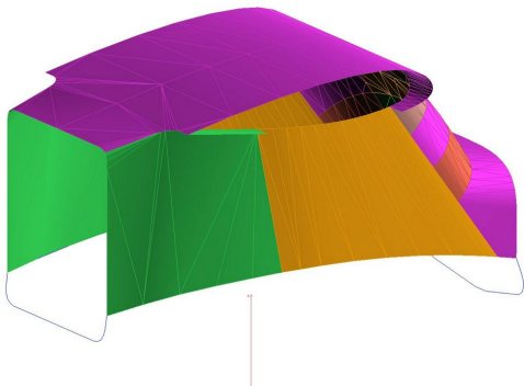
Vashon R-7 Ranger Canopy Cover, 3D model

This cover type is made from Silver Acrylic Sunbrella canvas and is 100% lined with a soft and smooth microfiber. Bruce's Custom Covers developed this material combination especially for aircraft protection. The outer material is medium weight and treated for water resistance, UV resistance and anti-static buildup. The inner lining is a very soft and smooth microfiber to prevent scratching. The material is very reflective, and tests show that the cabin interior temperature can be reduced to near-ambient temperature on the hottest of days. It is water, ice and snow repellent, yet breathable to allow moisture to escape from between the cover and the aircraft surface.