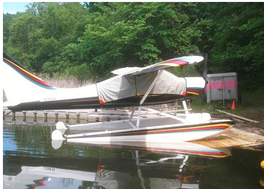
Glastar Sportsman Canopy Cover

Travel Covers are made with Silver Solution-Dyed Polyester fabric and only lined over the windshield to save weight. The material is lightweight and more compact for easy stowage in the aircraft. The polyester material is water resistant, but only intended for occasional use outside. We also have an ultra lightweight material available for fitted hangar dust covers. For daily outdoor use, the non-travel Sunbrella Cover is the best choice.