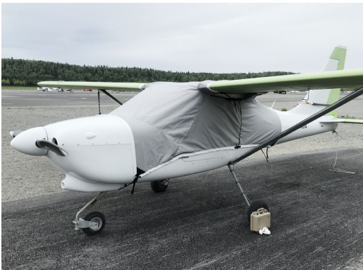
Glasair Aviation Glastar, Sportsman 2+2 Travel Cover, Light Weight Travel Canopy Cover