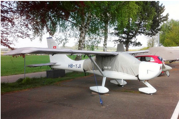
Glasair Aviation Glasair, Sportsman 2+2 Insulated Engine Cover OMF Symphony Canopy, Wings, Horiz. Stab, and Prop Covers