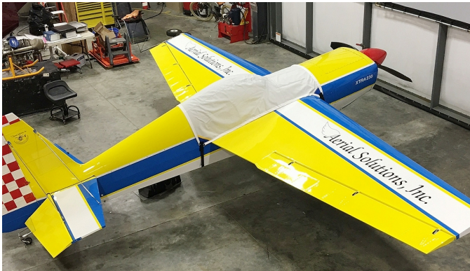
Extra 230 Canopy Cover

Travel Covers are made with Silver Solution-Dyed Polyester fabric and only lined over the windshield to save weight. The material is lightweight and more compact for easy stowage in the aircraft. The polyester material is water resistant, but only intended for occasional use outside. We also have an ultra lightweight material available for fitted hangar dust covers. For daily outdoor use, the non-travel Sunbrella Cover is the best choice.