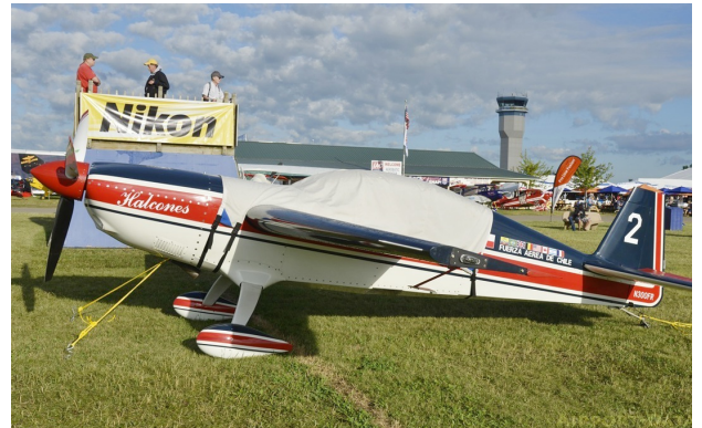
Extra 300 (mid-fuselage wing) Canopy Cover