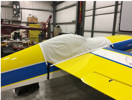
Extra 230 Canopy Cover

This cover type is made from Silver Acrylic Sunbrella canvas and is 100% lined with a soft and smooth microfiber. Bruce's Custom Covers developed this material combination especially for aircraft protection. The outer material is medium weight and treated for water resistance, UV resistance and anti-static buildup. The inner lining is a very soft and smooth microfiber to prevent scratching. The material is very reflective, and tests show that the cabin interior temperature can be reduced to near-ambient temperature on the hottest of days. It is water, ice and snow repellent, yet breathable to allow moisture to escape from between the cover and the aircraft surface.