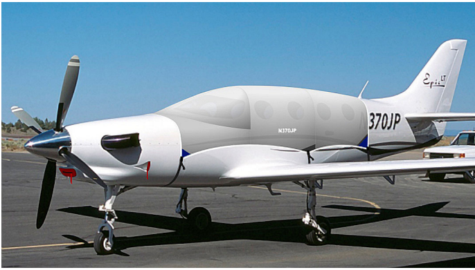
Epic LT Canopy Cover & Engine Plugs