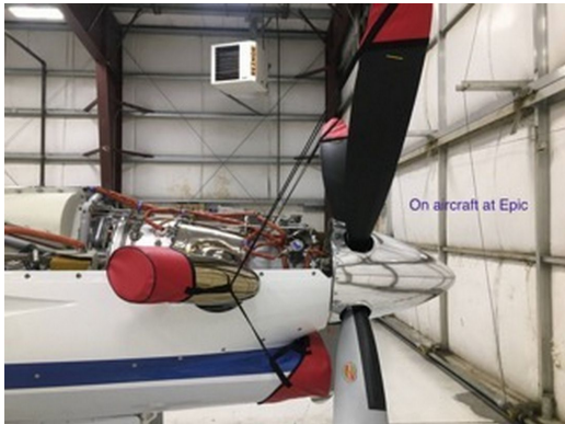
Epic Aircraft Prop Tie, Exhaust & Intake Covers