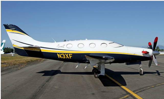
Epic LT Cockpit & Cabin HeatShields

This cover type is made from Silver Acrylic Sunbrella canvas and is 100% lined with a soft and smooth microfiber. Bruce's Custom Covers developed this material combination especially for aircraft protection. The outer material is medium weight and treated for water resistance, UV resistance and anti-static buildup. The inner lining is a very soft and smooth microfiber to prevent scratching. The material is very reflective, and tests show that the cabin interior temperature can be reduced to near-ambient temperature on the hottest of days. It is water, ice and snow repellent, yet breathable to allow moisture to escape from between the cover and the aircraft surface.