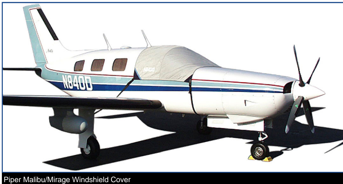
Piper Malibu/Mirage Windshield Cover