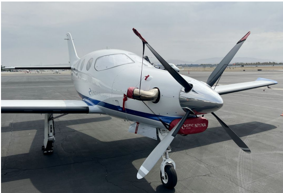
Epic Aircraft Prop Tie, Exhaust & Intake Covers Epic E1000 Prop Tie/Exhaust Covers, Intake Cover, Windshield HeatShields