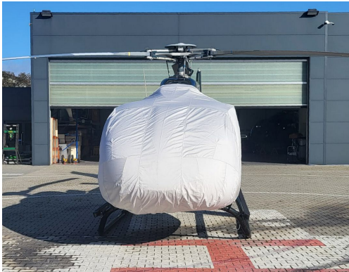
Airbus Helicopter H-130 Bubble Cover, Extends To Cover Fwd Engine Inlet

This cover type is made from Silver Acrylic Sunbrella canvas and is 100% lined with a soft and smooth microfiber. Bruce's Custom Covers developed this material combination especially for aircraft protection. The outer material is medium weight and treated for water resistance, UV resistance and anti-static buildup. The inner lining is a very soft and smooth microfiber to prevent scratching. The material is very reflective, and tests show that the cabin interior temperature can be reduced to near-ambient temperature on the hottest of days. It is water, ice and snow repellent, yet breathable to allow moisture to escape from between the cover and the aircraft surface.