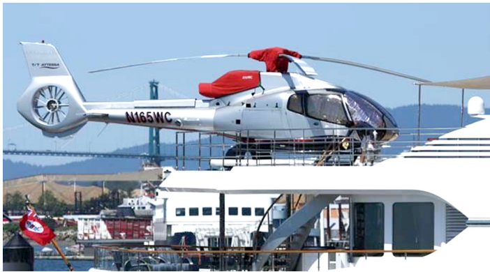
Intake/Exhaust Cover & Rotor Hub Cover (w/ skirt)

tight at the blade root with straps and quick-release plastic buckles. The Cold Weather Blade Covers are fitted with full-length zippers and optional deice “boots” designed to accept a preheater hose; a small opening at the tip of the cover allows for some air circulation and drainage in freezing weather. Some part numbers have features for an extra charge.