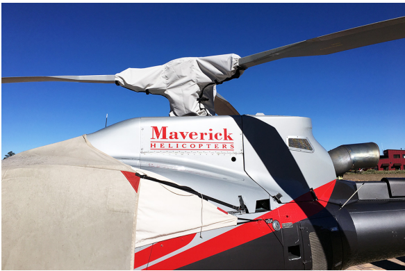
Eurocopter EC-130 Main Rotor Hub Cover