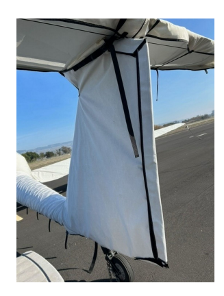
Dimona HK-36 Empennage Cover Set

WINTER USE MATERIAL - Made with Solution-Dyed Polyester fabric, this option is intended for seasonal use to aid in deicing, rain mitigation, or for occasional travel. The material is lighter and more compact, but more susceptible to UV damage and may have a shorter useful life if used continuously outside than the all-year use material.