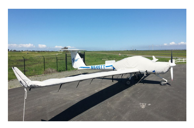
Dimona/Diamond HK36 Extreme Canopy/Engine, Wing Covers