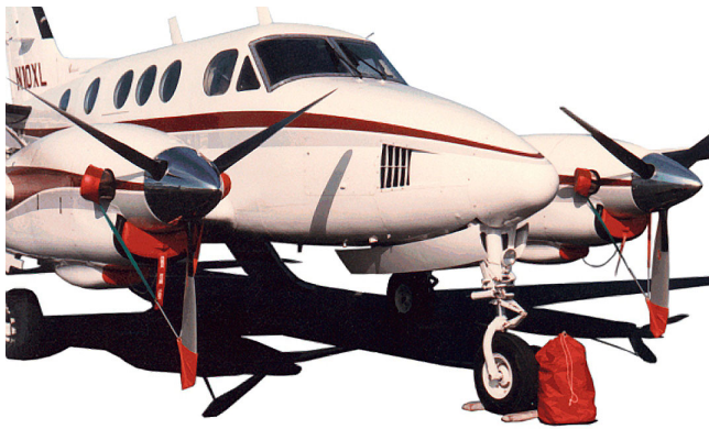
Pitot, Exhaust Covers, Engine Plugs & Prop Ties