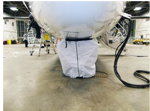
Q400, Nose gear landing/tire covers - Cold Weather Ops