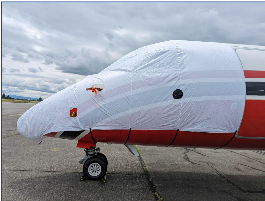
DeHavilland Dash 8, Q400 Cockpit/Nose Cover, test fit cover