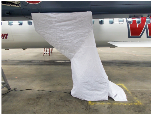
Q400, Main gear landing/tire covers - Cold Weather Ops

ALL-YEAR USE MATERIAL - Made with Silver Acrylic Sunbrella canvas, the all-year use material is the best option for sun protection and cover longevity. This heavier more durable material is intended for all weather conditions, such as rain and snow or lots of sun.