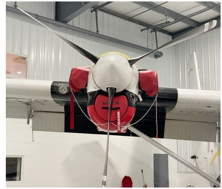
DeHavilland DH-6 Intake Plugs, Exhaust Covers