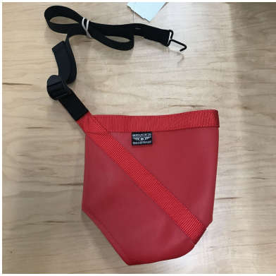
Prop Tie-Down, Various Models (secures with a hook to engine nacelle)