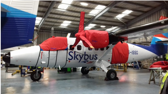
DeHavilland Twin Otter DHC6 (UV-18A) Cockpit Cover (CUSTOM COLOR)