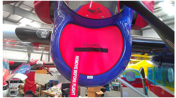
DeHavilland Twin Otter DHC6 Pitot Covers with Static Port Plugs De Havilland Twin Otter Engine Inlet Plug and Exhaust Covers