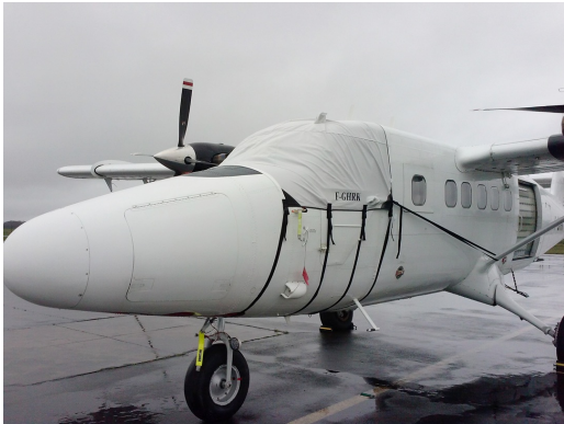
Twin Otter Cockpit Cover

water resistance, UV resistance and anti-static buildup. The inner lining is a very soft and smooth microfiber to prevent scratching. The material is very reflective, and tests show that the cabin interior temperature can be reduced to near-ambient temperature on the hottest of days. It is water, ice and snow repellent, yet breathable to allow moisture to escape from between the cover and the aircraft surface.