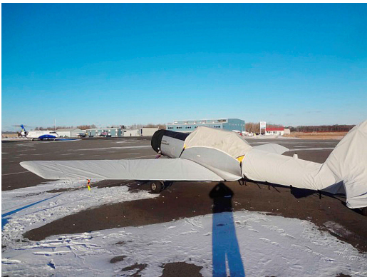
De Havilland DH1 Chipmunk Engine, Wings, Canopy and Empennage Covers