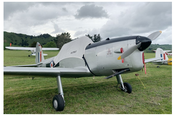
DeHavilland Chipmunk Canopy Cover, Engine Plugs