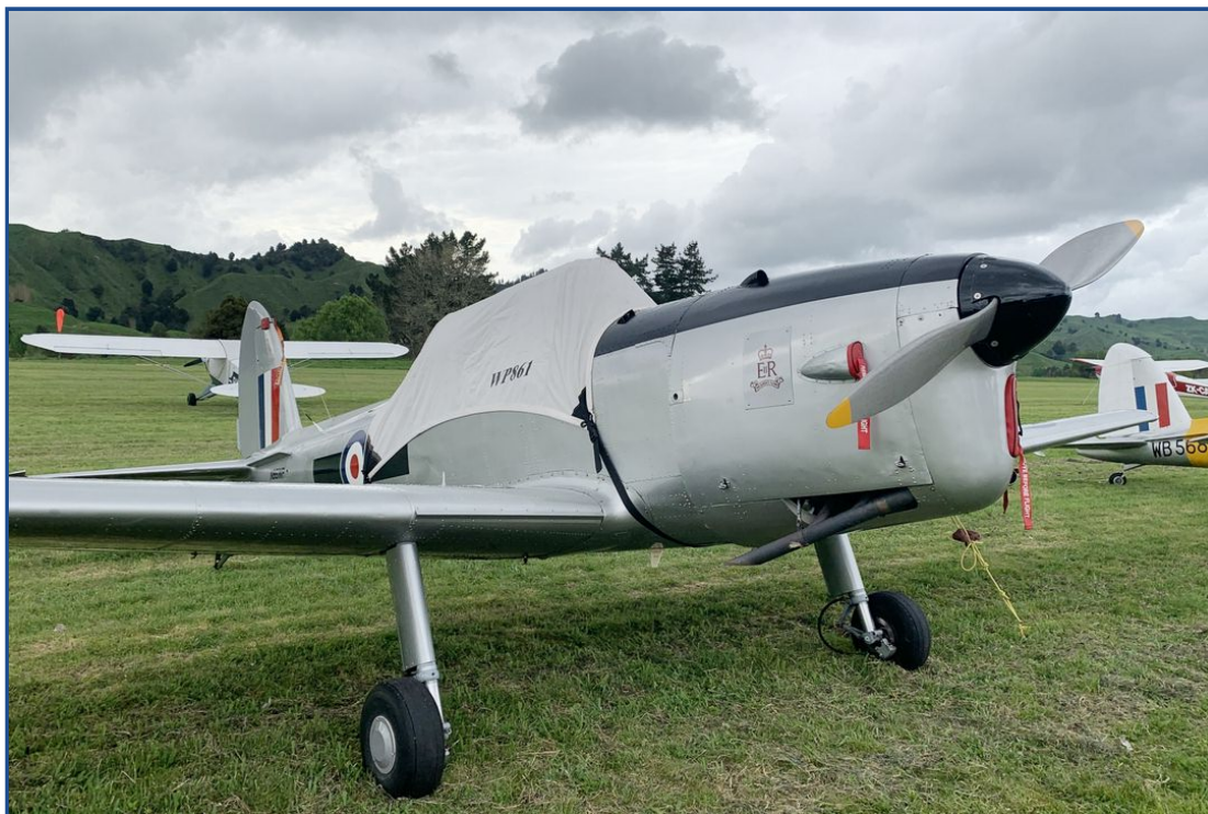
DeHavilland Chipmunk Canopy Cover, Engine Plugs