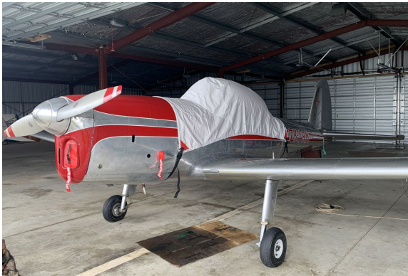
Chipmunk DHC-1A-1 Canopy Cover, Engine Inlet Plugs