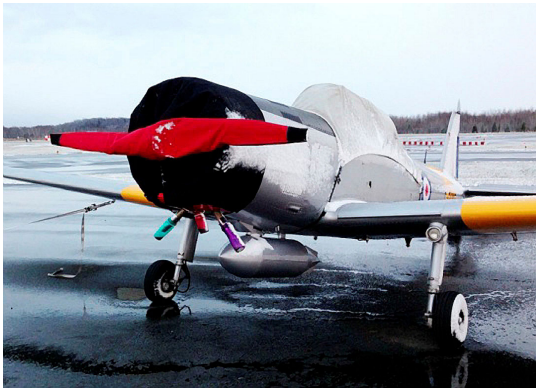
De Havilland DH1 Chipmunk Canopy Cover (English Canopy), & Prop Cover

This cover type is made from Silver Acrylic Sunbrella canvas and is 100% lined with a soft and smooth microfiber. Bruce's Custom Covers developed this material combination especially for aircraft protection. The outer material is medium weight and treated for water resistance, UV resistance and anti-static buildup. The inner lining is a very soft and smooth microfiber to prevent scratching. The material is very reflective, and tests show that the cabin interior temperature can be reduced to near-ambient temperature on the hottest of days. It is water, ice and snow repellent, yet breathable to allow moisture to escape from between the cover and the aircraft surface.