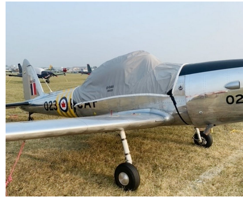
DeHavilland Chipmunk Travel Weight Canopy Cover