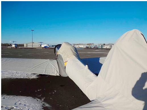
De Havilland DH1 Chipmunk Engine, Wings, Canopy and Empennage Covers

WINTER USE MATERIAL - Made with Solution-Dyed Polyester fabric, this option is intended for seasonal use to aid in deicing, rain mitigation, or for occasional travel. The material is lighter and more compact, but more susceptible to UV damage and may have a shorter useful life if used continuously outside than the all-year use material.