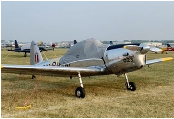
DeHavilland Chipmunk Travel Weight Canopy Cover