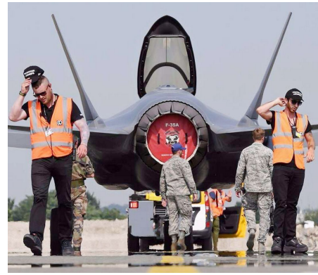
Lockheed Martin F-35 Exhaust Plug, non-folding type