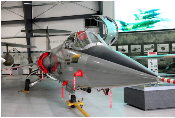
Lockheed F-104 Starfighter Intake Plugs