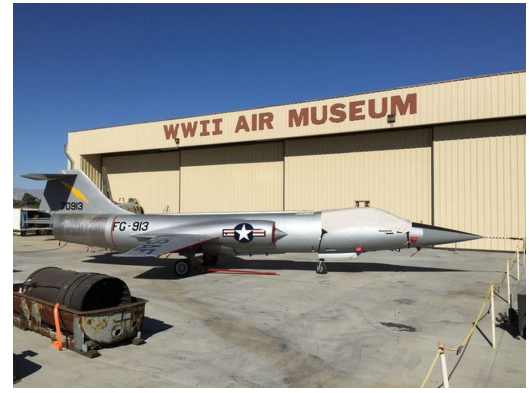
Lockheed F-104 Starfighter Canopy Cover, Single Seat Model