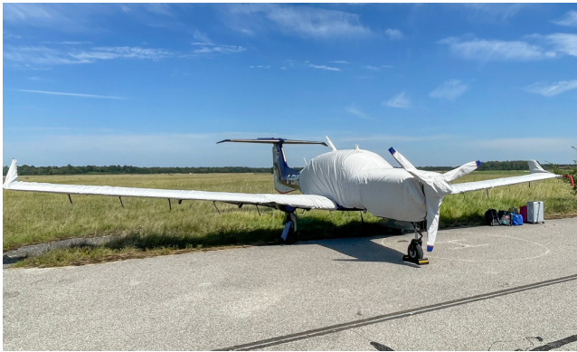
Diamond DA-50 Extended Canopy/Engine Cover, Wing & Prop Covers

WINTER USE MATERIAL - Made with Solution-Dyed Polyester fabric, this option is intended for seasonal use to aid in deicing, rain mitigation, or for occasional travel. The material is lighter and more compact, but more susceptible to UV damage and may have a shorter useful life if used continuously outside than the all-year use material.