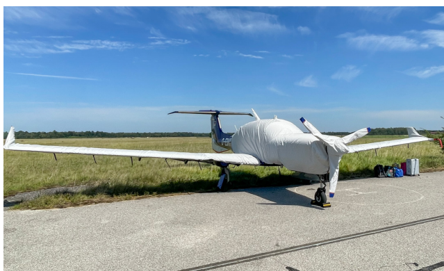
Diamond DA-50 Extended Canopy/Engine Cover, Wing & Prop Covers

This cover type is made from Silver Acrylic Sunbrella canvas and is 100% lined with a soft and smooth microfiber. Bruce's Custom Covers developed this material combination especially for aircraft protection. The outer material is medium weight and treated for water resistance, UV resistance and anti-static buildup. The inner lining is a very soft and smooth microfiber to prevent scratching. The material is very reflective, and tests show that the cabin interior temperature can be reduced to near-ambient temperature on the hottest of days. It is water, ice and snow repellent, yet breathable to allow moisture to escape from between the cover and the aircraft surface.