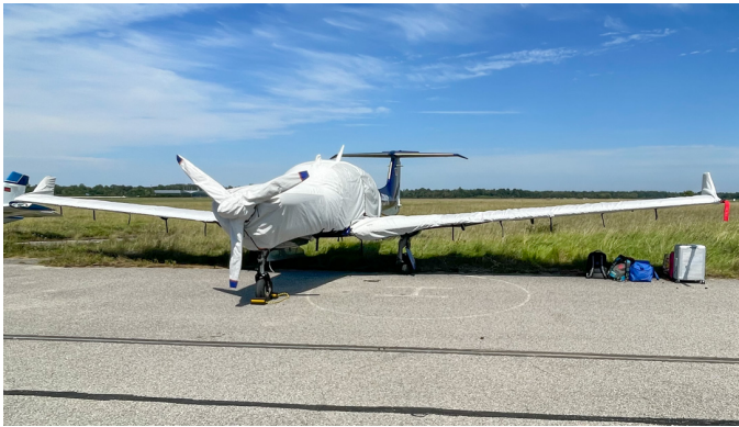
Diamond DA-50 Extended Canopy/Engine Cover, Wing & Prop Covers