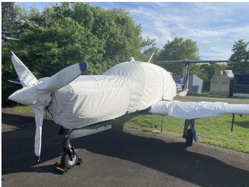
Diamond DA-50 Extended Canopy/Engine, Prop & Wing Covers (test fit)