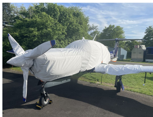
Diamond DA-50 Extended Canopy/Engine, Prop & Wing Covers (test fit)