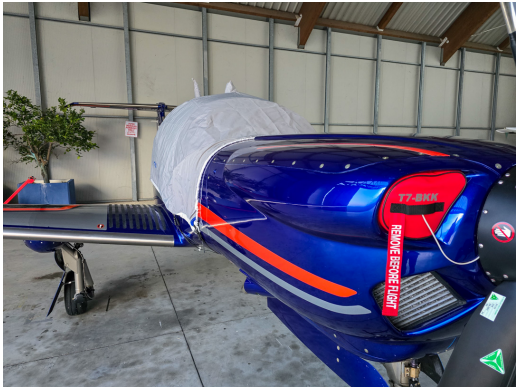
Diamond DA-50 Canopy Cover, Engine Plugs

Engine Inlet Plugs are custom fit for your Diamond DA-50 Superstar intakes, made with heavy-duty vinyl material, and stuffed with a single block of sculpted urethane foam. Each plug has a zipper that allows the foam to be removed and dried if necessary. Engine plugs have warning flags that are visible from the cockpit or 'remove before flight' streamers sewn onto the face of the plugs. Most plugs are imprinted with the aircraft registration number in black for an extra charge. Storage bag NOT included. Engine plugs may be inserted after flight when the engine is still warm. Engine Inlet Plugs are commonly referred to as Cowl Plugs, Intake Plugs, Cowl Blocks, Engine Blocks, and Engine Bungs.