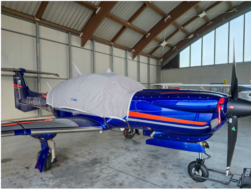
Diamond DA-50 Canopy Cover, Engine Plugs