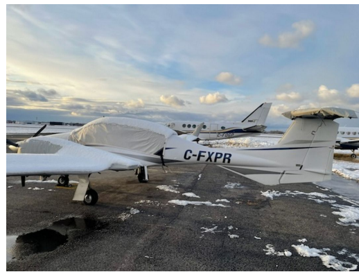
Diamond DA-42 Extended Canopy/Nose & Engine Covers Diamond DA-42 Canopy, Wing, Engine & Horizontal Stabilizer Covers