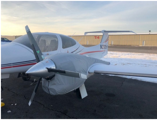
Diamond DA-42 Light Weight Travel Engine Covers