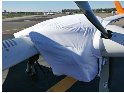
DA42 MPP Guardian (DA42-NG) Engine Cover, test fit cover