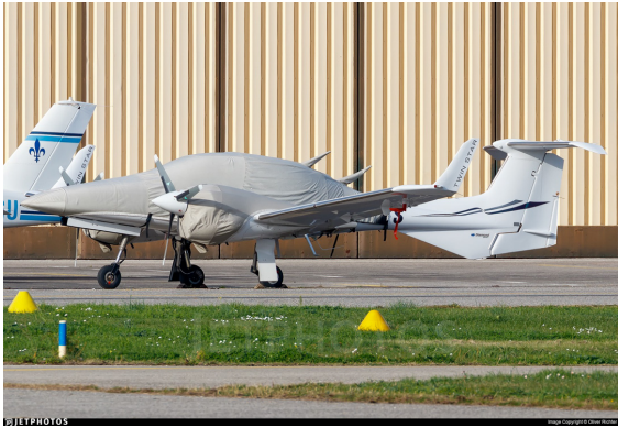
Diamond DA-42 Extended Canopy/Nose Cover, Engine Covers

The material is very reflective, and tests show that the cabin interior temperature can be reduced to near-ambient temperature on the hottest of days. It is water, ice and snow repellent, yet breathable to allow moisture to escape from between the cover and the aircraft surface.