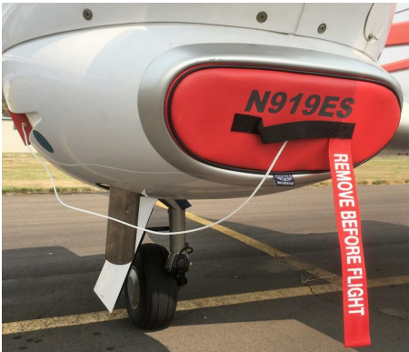
Diamond Da-42 Engine Inlet Plugs Set of 4

Engine Inlet Plugs are custom fit for your Diamond DA-42 Twin Star intakes, made with heavy-duty vinyl material, and stuffed with a single block of sculpted urethane foam. Each plug has a zipper that allows the foam to be removed and dried if necessary. Engine plugs have warning flags that are visible from the cockpit or 'remove before flight' streamers sewn onto the face of the plugs. Most plugs are imprinted with the aircraft registration number in black for an extra charge. Storage bag NOT included. Engine plugs may be inserted after flight when the engine is still warm. Engine Inlet Plugs are commonly referred to as Cowl Plugs, Intake Plugs, Cowl Blocks, Engine Blocks, and Engine Bungs.