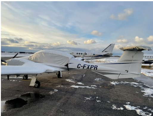
Diamond DA-42 Canopy, Wing, Engine & Horizontal Stabilizer Covers

WINTER USE MATERIAL - Made with Solution-Dyed Polyester fabric, this option is intended for seasonal use to aid in deicing, rain mitigation, or for occasional travel. The material is lighter and more compact, but more susceptible to UV damage and may have a shorter useful life if used continuously outside than the all-year use material.