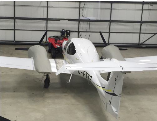
Diamond DA-42 Twinstar Engine Covers