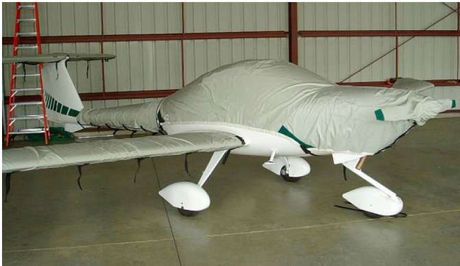
DA-20 Canopy/Engine, Prop/Spinner, Wing, Tailboom, Horiz. Stab. Covers