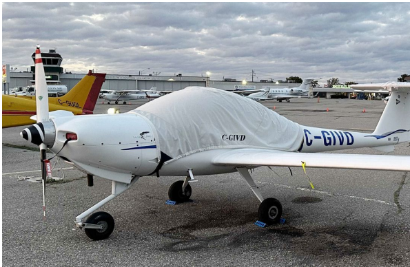
Diamond DA-20 Canopy Cover

This cover type is made from Silver Acrylic Sunbrella canvas and is 100% lined with a soft and smooth microfiber. Bruce's Custom Covers developed this material combination especially for aircraft protection. The outer material is medium weight and treated for water resistance, UV resistance and anti-static buildup. The inner lining is a very soft and smooth microfiber to prevent scratching. The material is very reflective, and tests show that the cabin interior temperature can be reduced to near-ambient temperature on the hottest of days. It is water, ice and snow repellent, yet breathable to allow moisture to escape from between the cover and the aircraft surface.