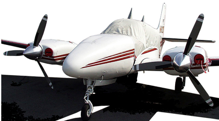
Baron 58 Standard Canopy Cover & Engine Plugs

This cover type is made from Silver Acrylic Sunbrella canvas and is 100% lined with a soft and smooth microfiber. Bruce's Custom Covers developed this material combination especially for aircraft protection. The outer material is medium weight and treated for water resistance, UV resistance and anti-static buildup. The inner lining is a very soft and smooth microfiber to prevent scratching. The material is very reflective, and tests show that the cabin interior temperature can be reduced to near-ambient temperature on the hottest of days. It is water, ice and snow repellent, yet breathable to allow moisture to escape from between the cover and the aircraft surface.