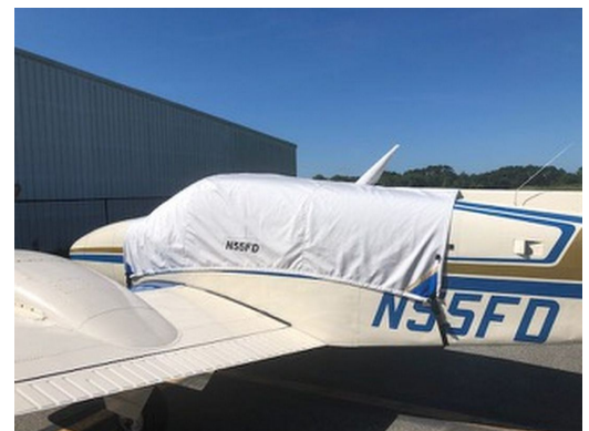
Beech Baron 95-B55 Canopy cover