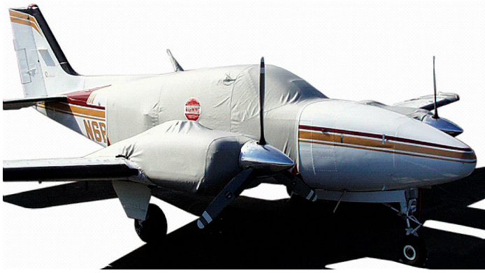
Standard Canopy Cover & Engine Plugs. Extended Canopy Cover & Engine Cover