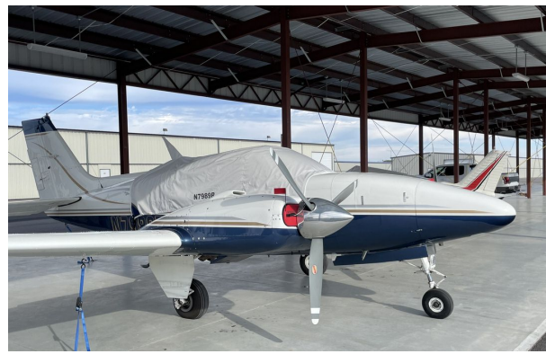
Beech Baron D55 Canopy Cover, Engine Plugs