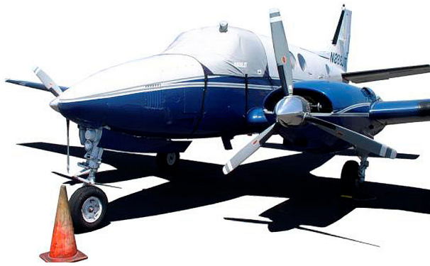
King Air Cockpit Cover, belly-strap type