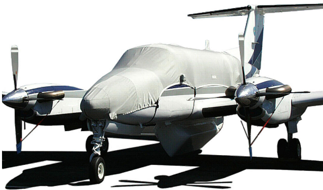
King Air Canopy/Nose Cover