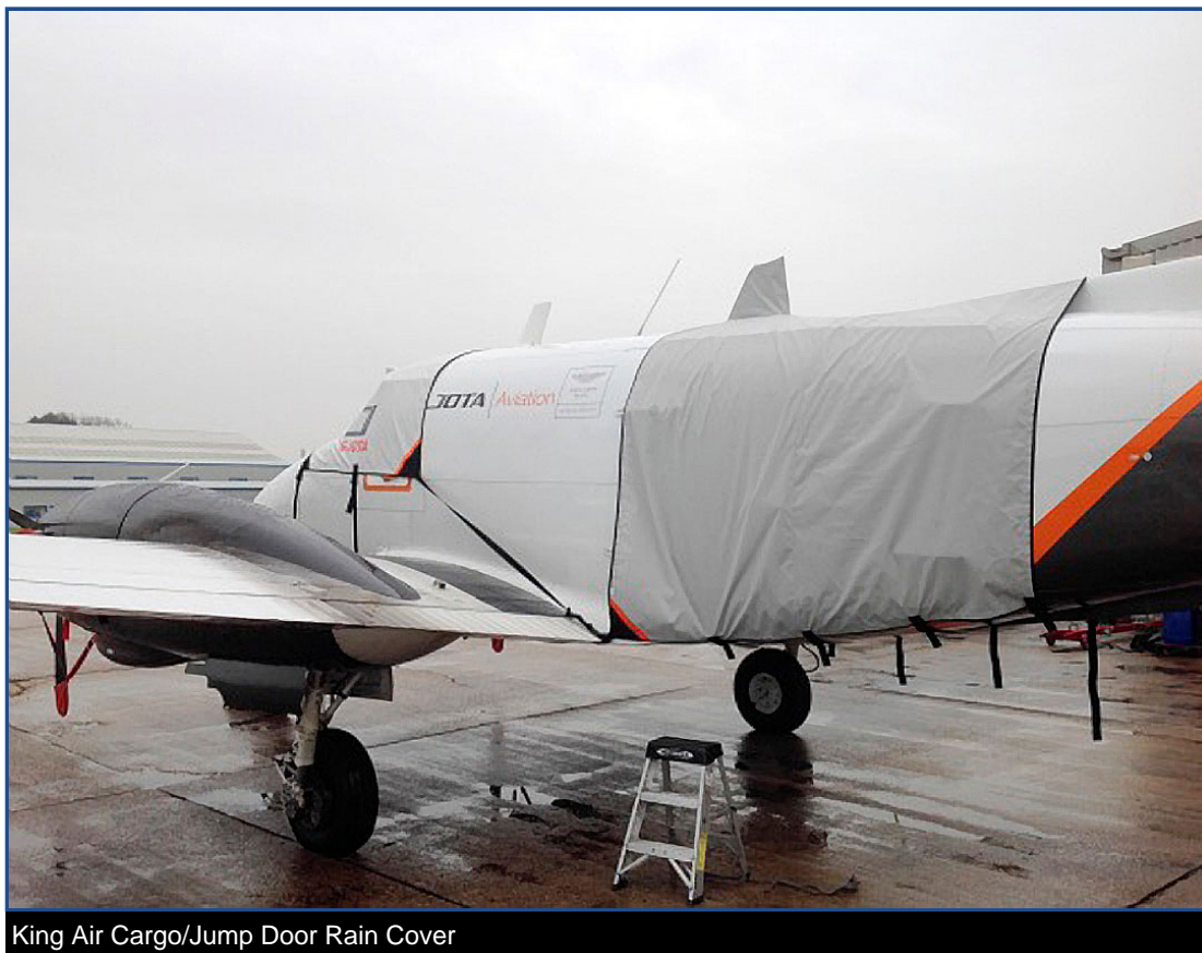
King Air Cargo/Jump Door Rain Cover