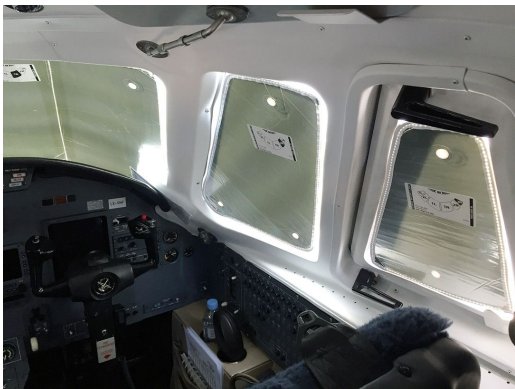
Cessna Citation XL, XLS (560XL) Cockpit Heatshields

Cockpit Heatshields are interior sunshades for the aircraft's cockpit. The product is a unique composite of closed-cell foam with a silver mylar finish. The semi-rigid design is stiff enough to stand inside the window framing. The set folds up flat and is easily stored in the included storage sleeve. Some designs may require velcro and suction cups. Our Heatshields for jets are offered white side out because some aircraft manufacturers have issued advisories against reflective window inserts due to potential heat damage. A Heatshield is an excellent short-term remedy for cockpit overheating, but an external fabric cover is more effective for long-term protection.