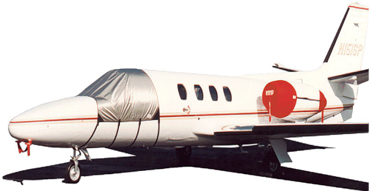
Cessna Citation I Windshield, Pitot and Engine Covers